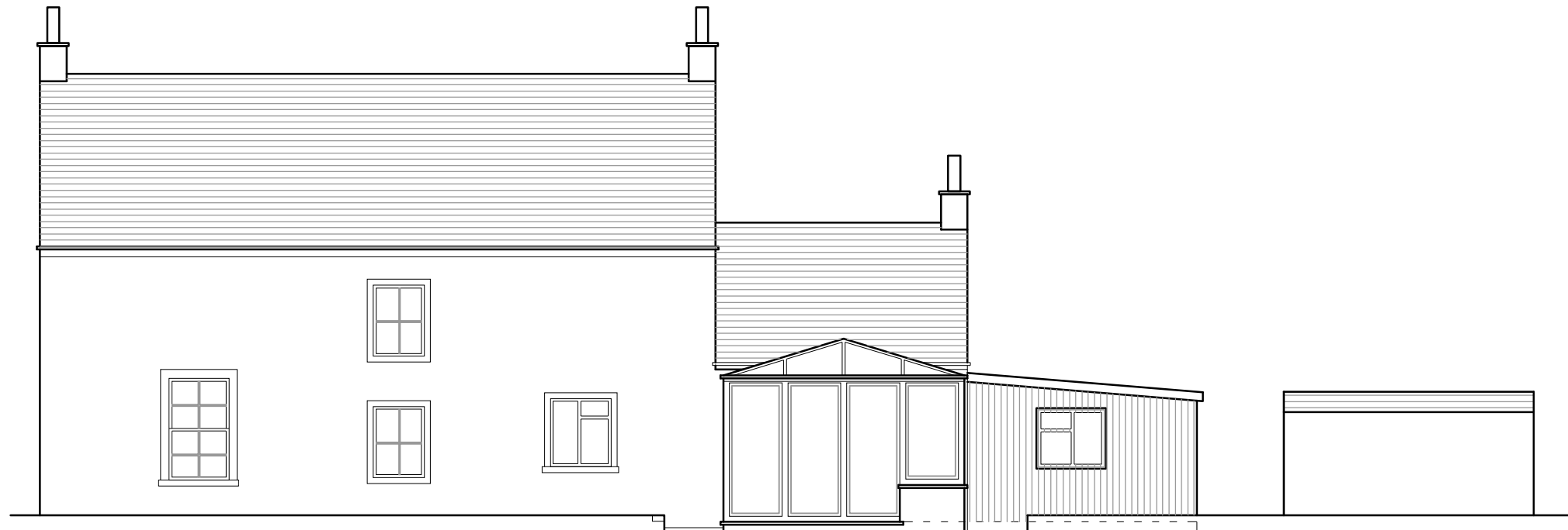
2 Rear Elevation As Existing