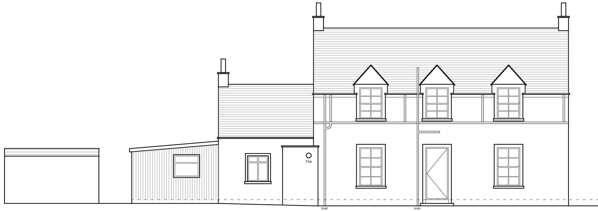
1 Front Elevation As Existing