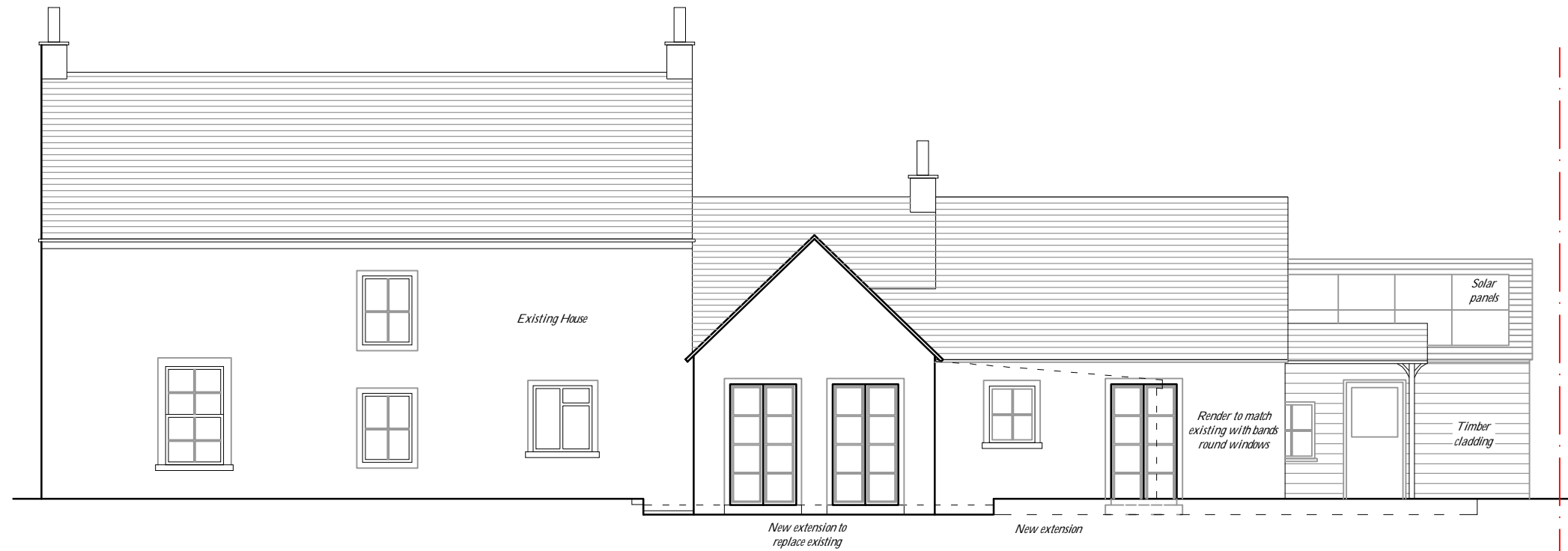
2 Rear Elevation As Proposed