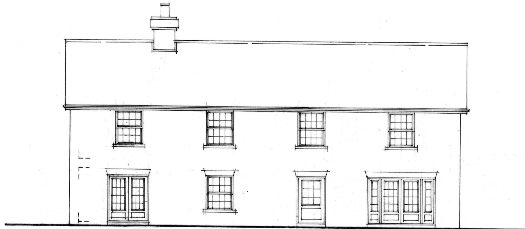
S O U T H E A S T E L E V A T I O N