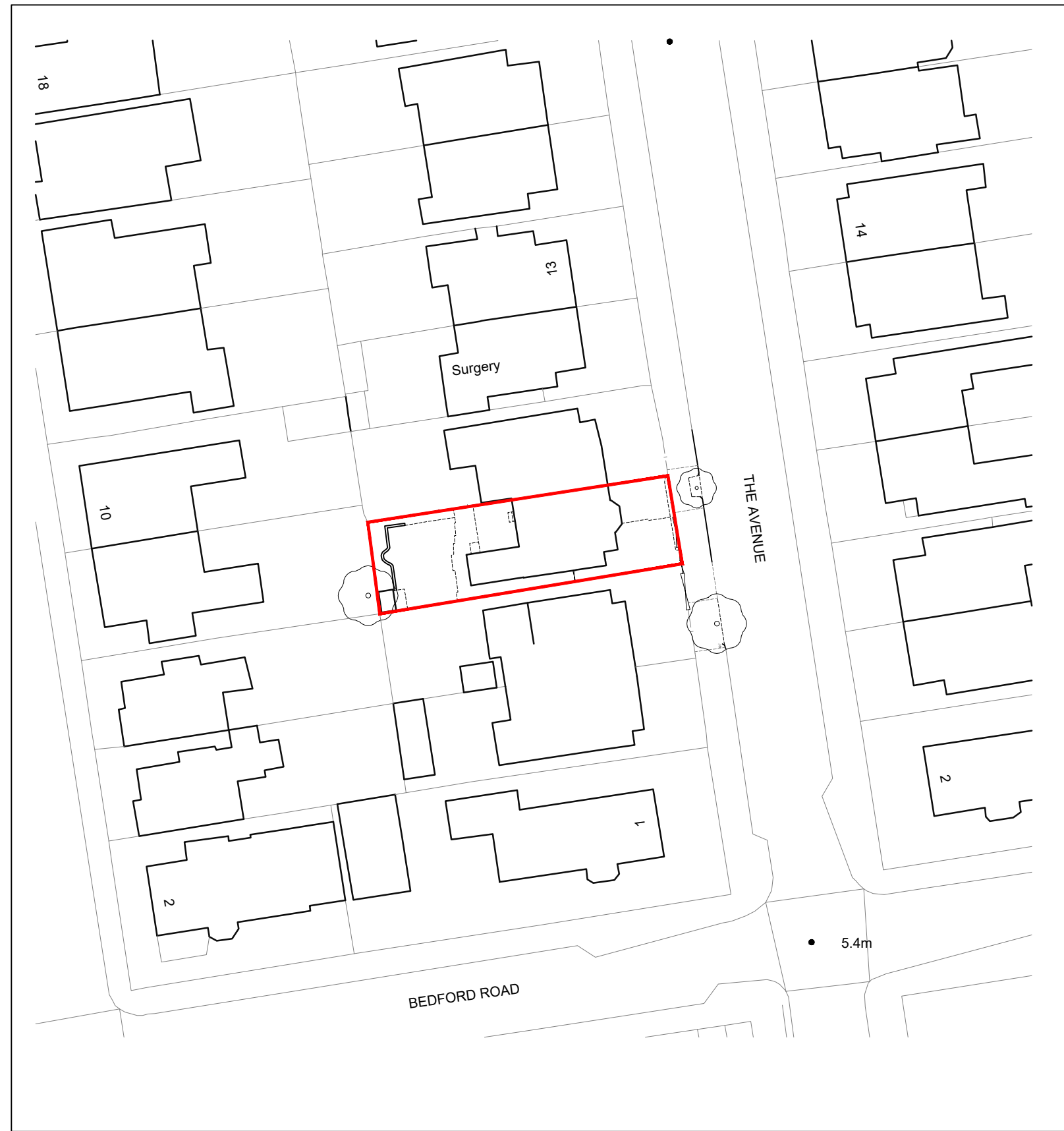
PROPOSED BLOCK PLAN 1:500