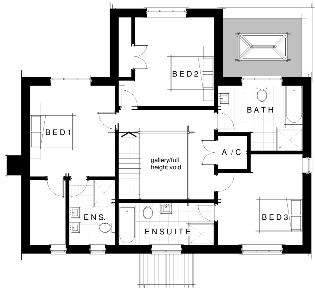
FIRST 1 : 100