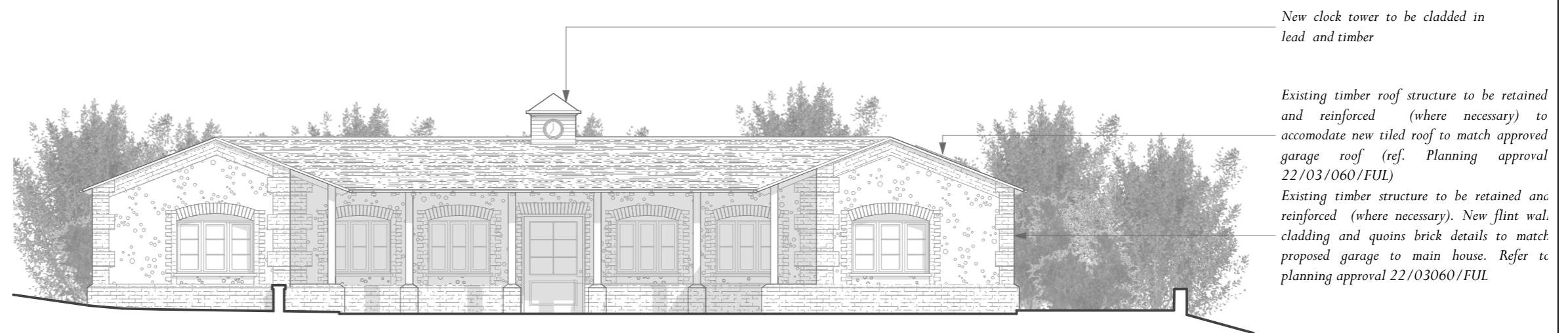
PROPOSED STABLES WEST ELEVATION