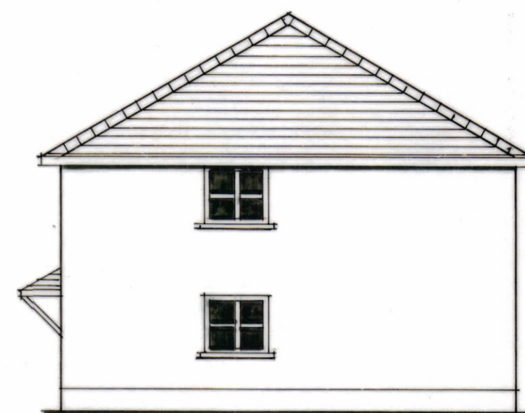
PROPOSED SIDE ELEVATION (D)