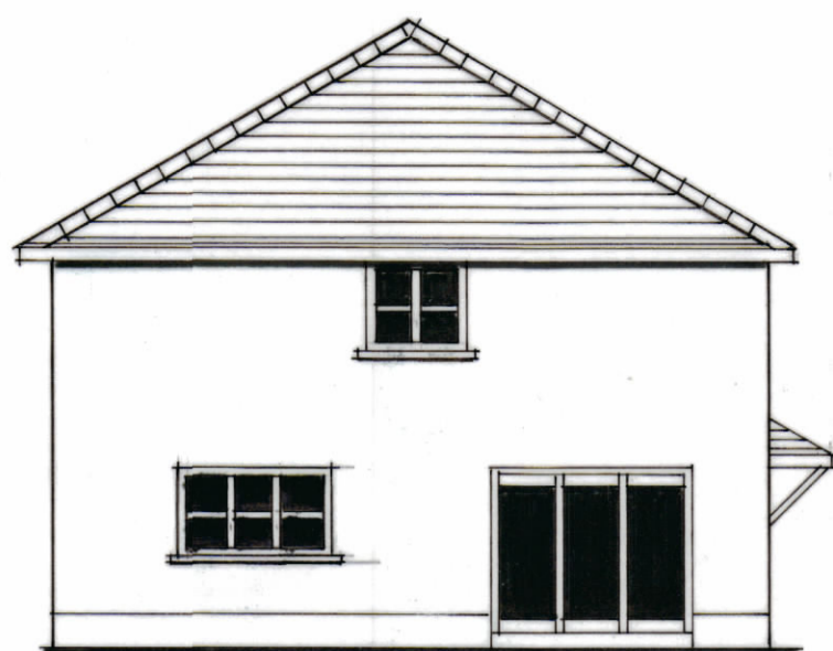
PROPOSED SIDE ELEVATION (B)