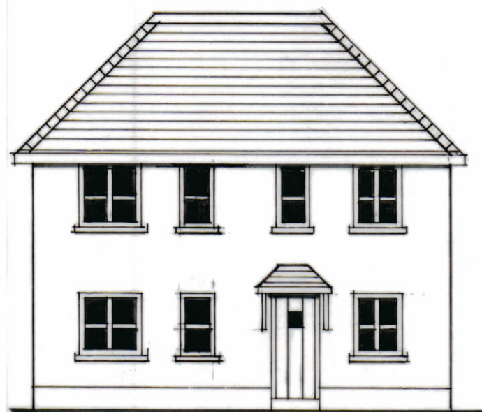
PROPOSED FRONT ELEVATION (A)