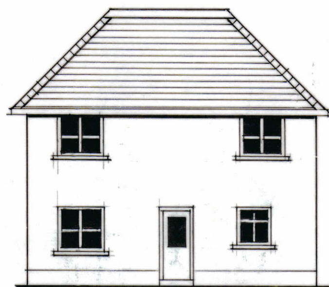
PROPOSED REAR ELEVATION (C)