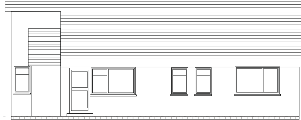
Northwest (Rear) Elevation