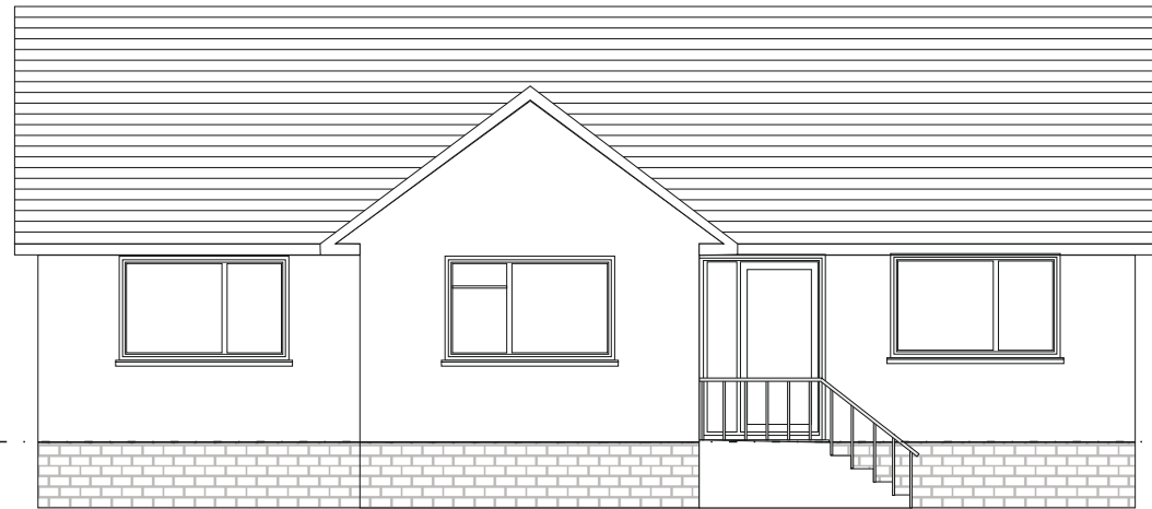
Southeast (Front) Elevation