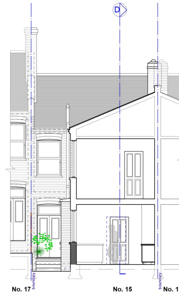
SECTION C-C Scale 1:100