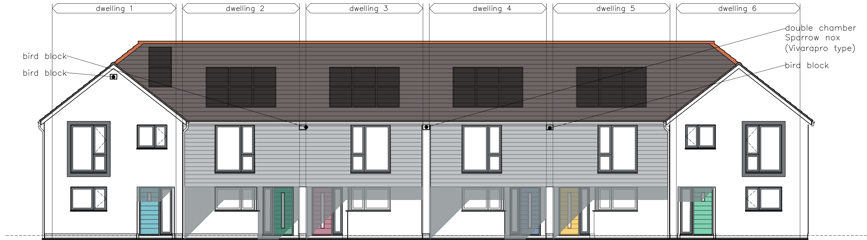
north east elevation as proposed