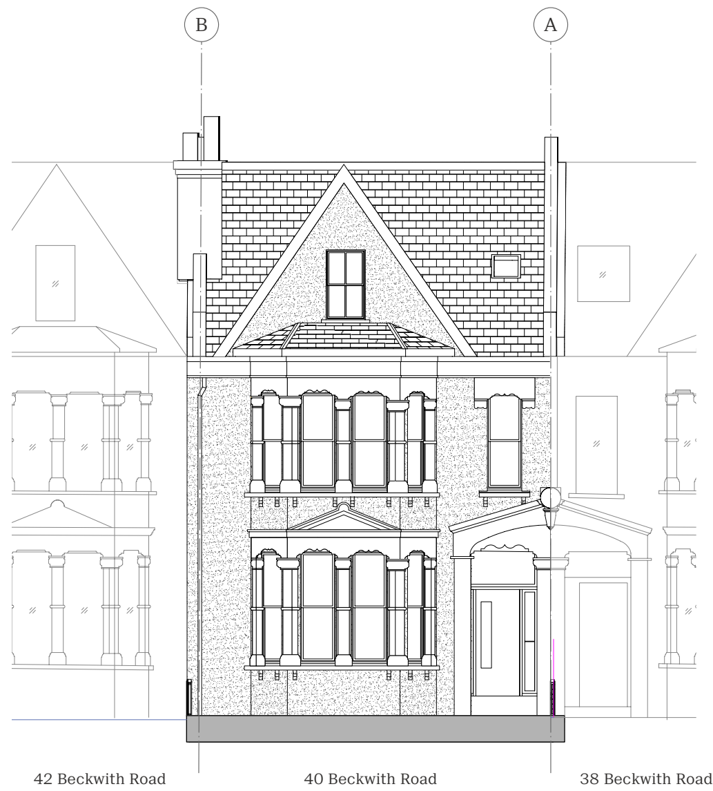
1 Front Elevation - Existing E/300 Scale: 1:100