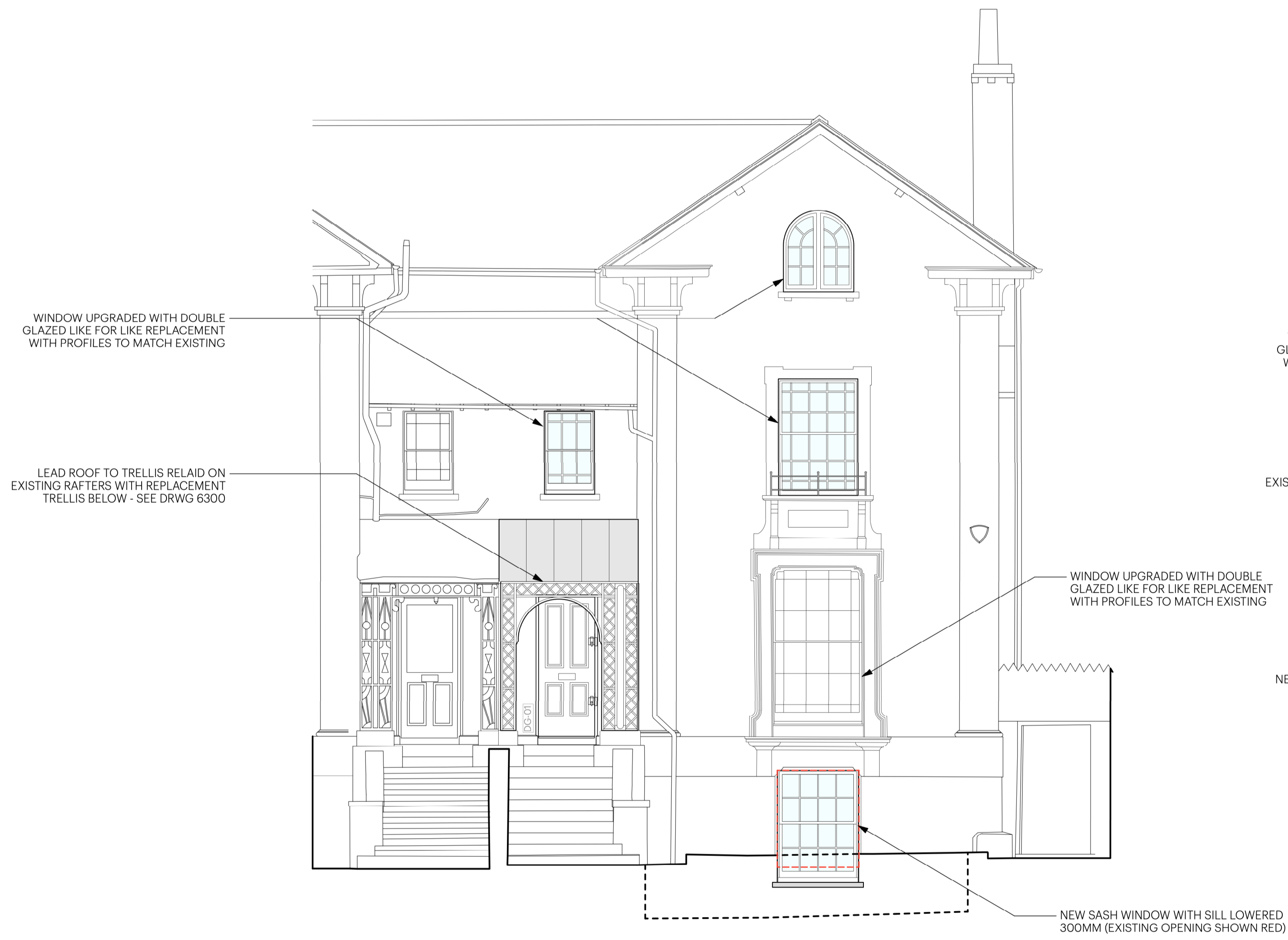
1 PROPOSED FRONT ELEVATION Scale: 1:50