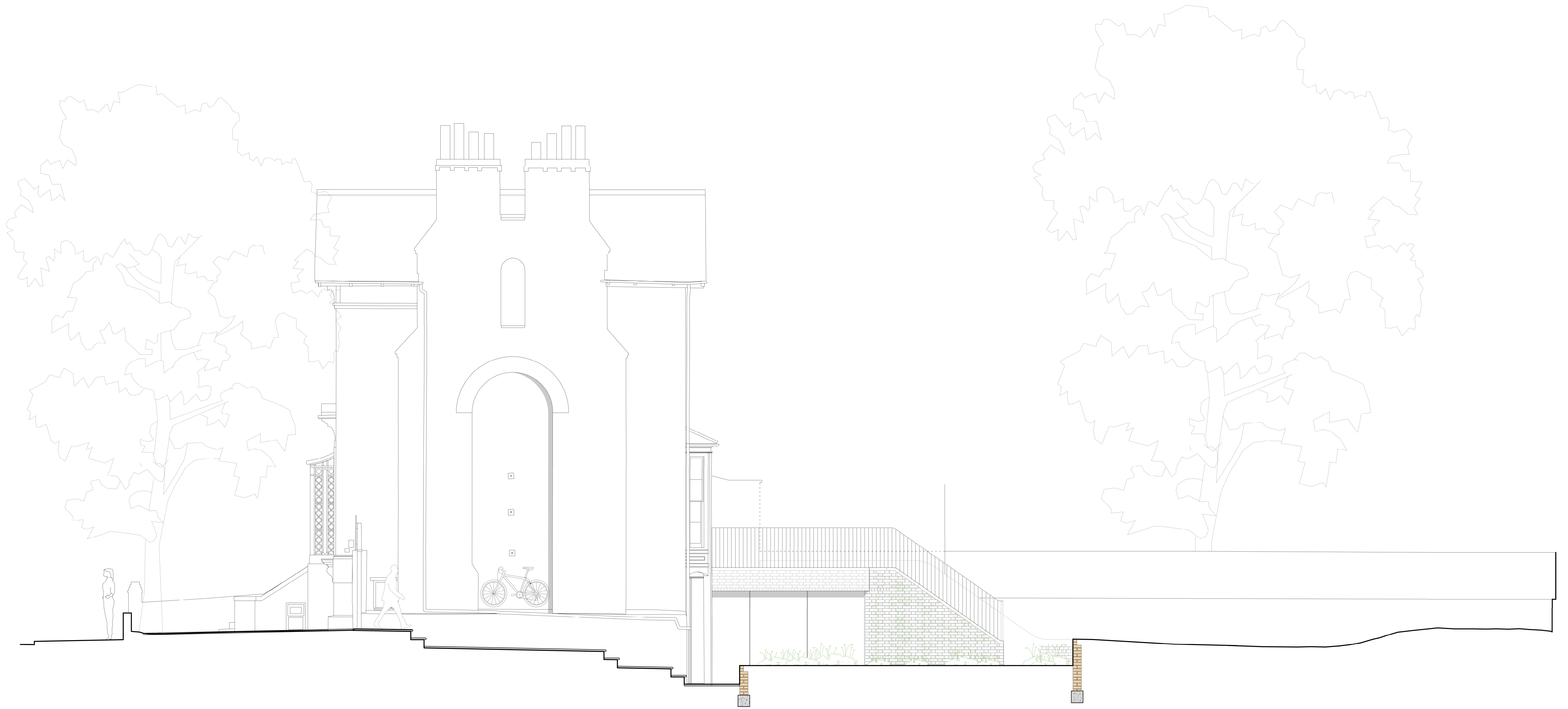
1 PROPOSED SIDE ELEVATION Scale: 1:50