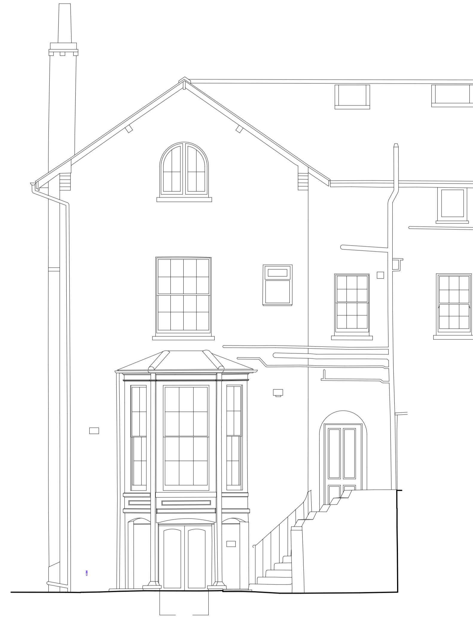
2 EXISTING REAR ELEVATION Scale: 1:50