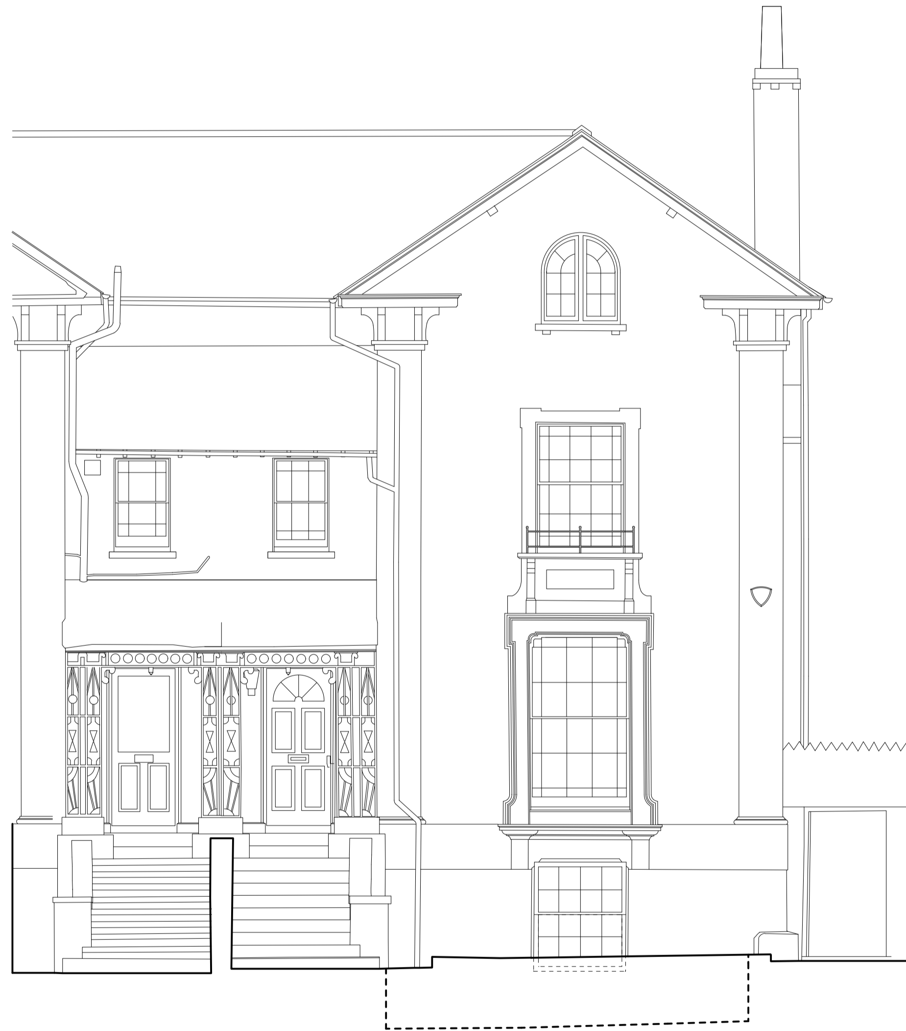
1 EXISTING FRONT ELEVATION Scale: 1:50