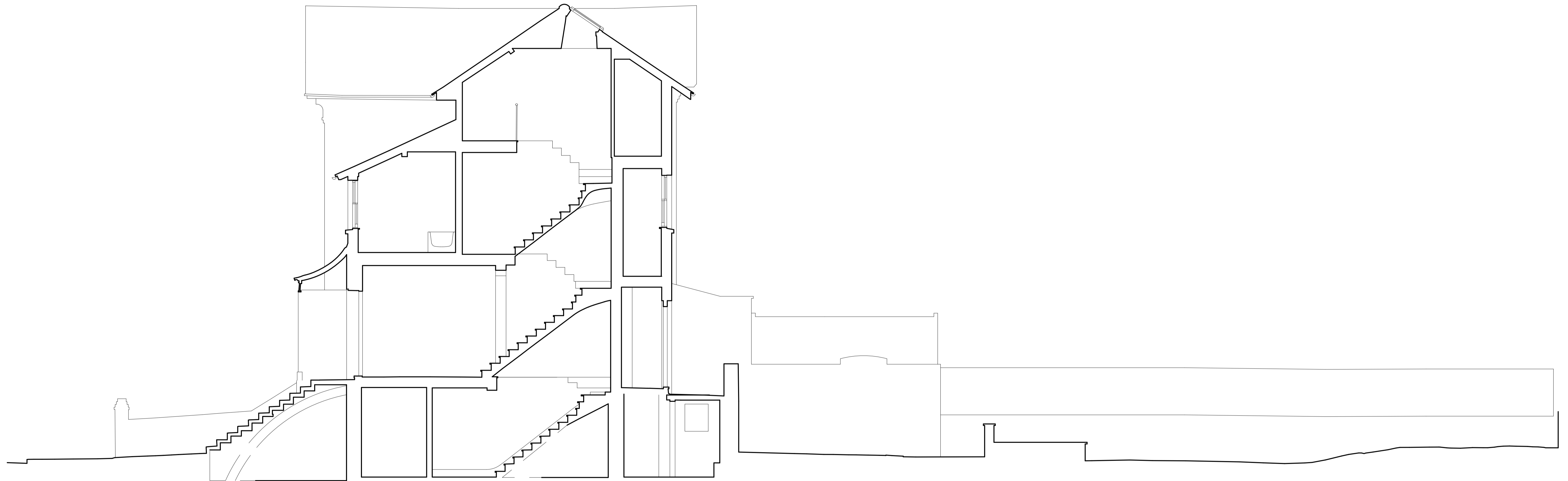
1 EXISTING SECTION BB Scale: 1:50