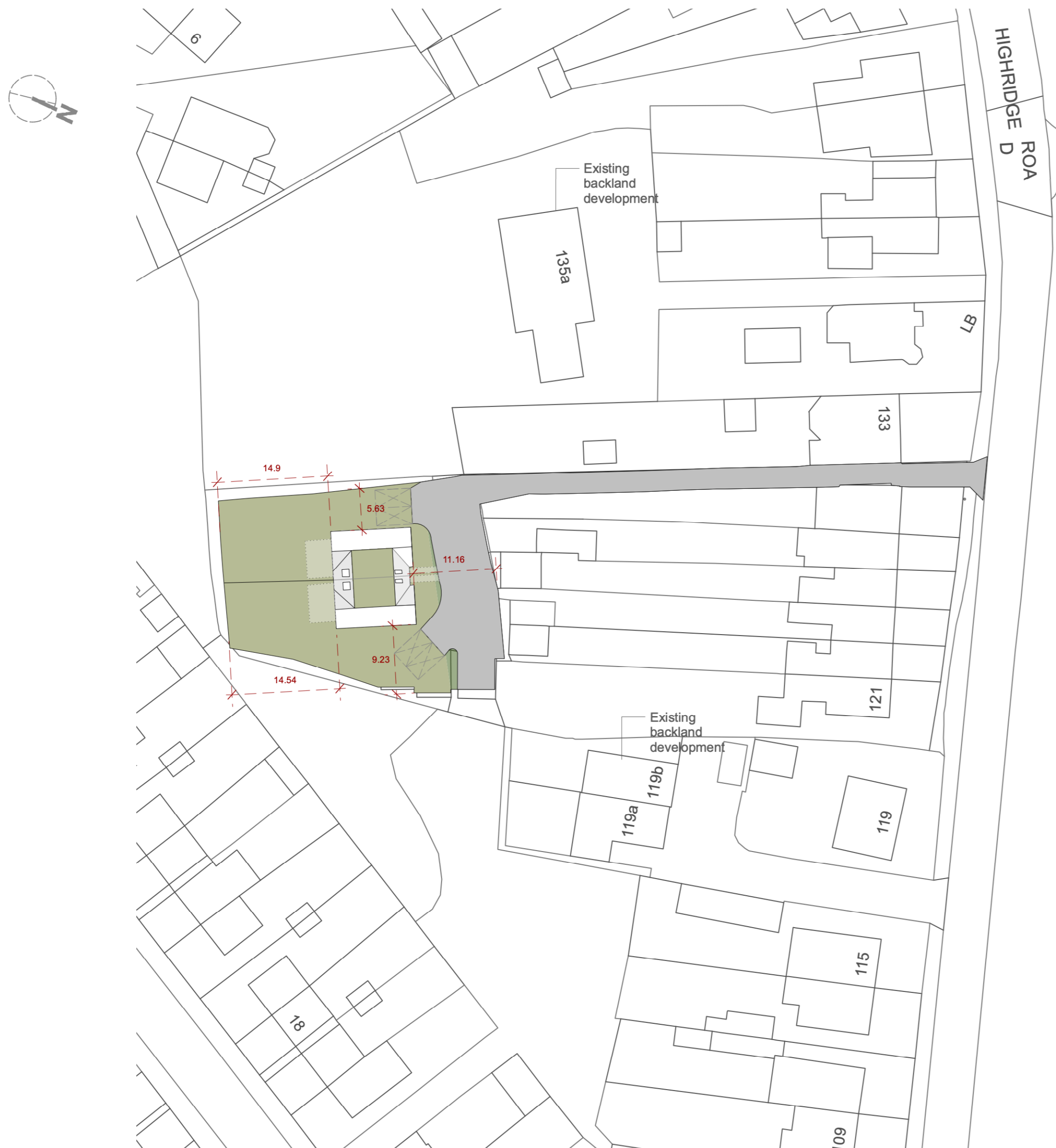
1 BLOCK PLAN Scale: 1:500