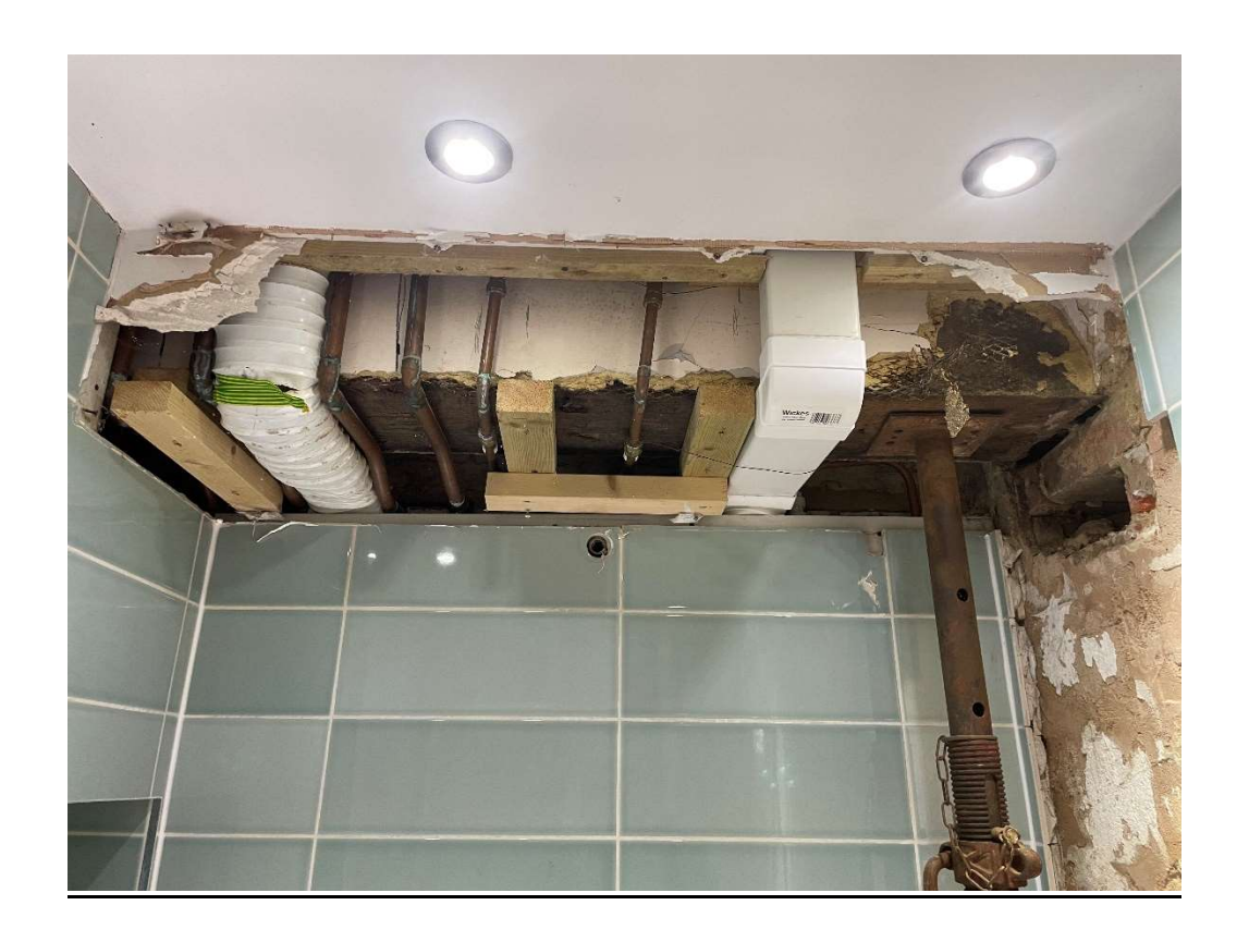
<u>Timber Lintol to be replaced with concrete lintol</u>