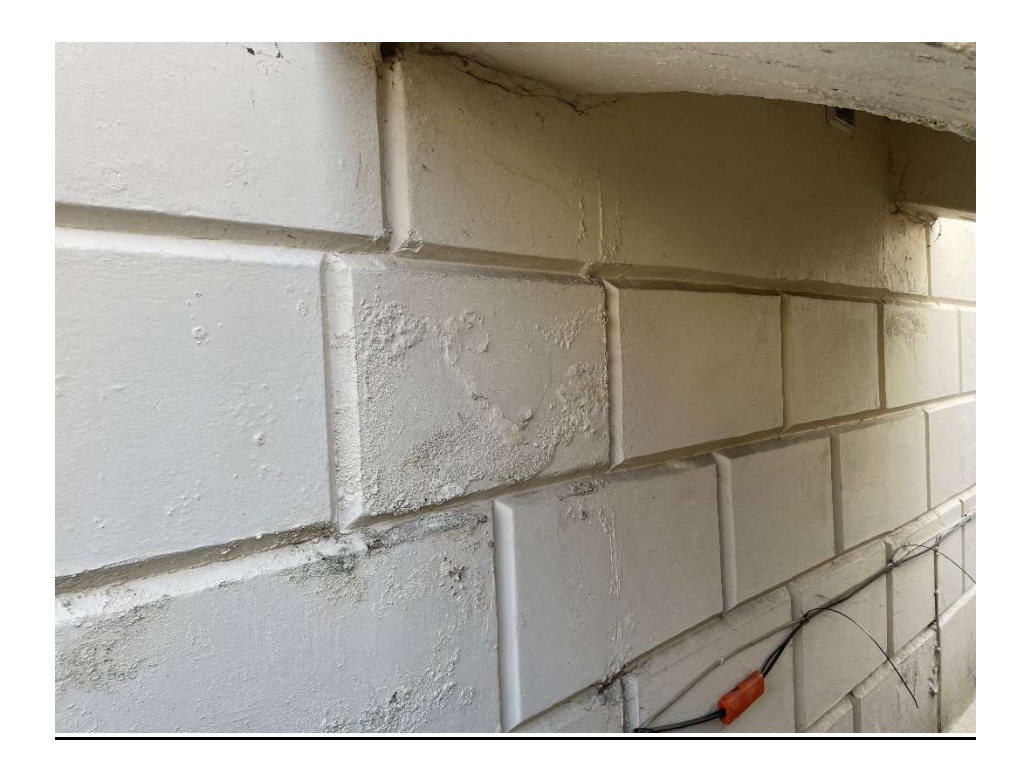
Blown paintwork to stucco detailing to be repaired and redecorated