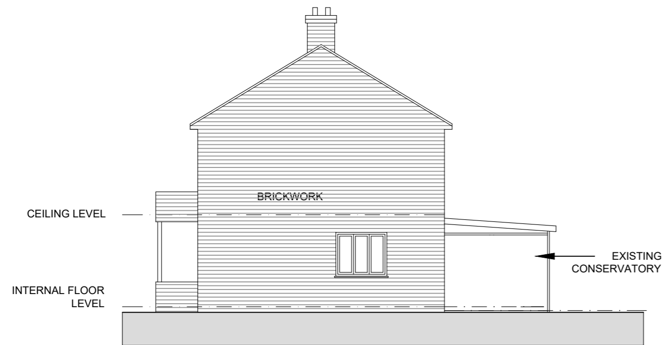
Existing Side Elevation 3