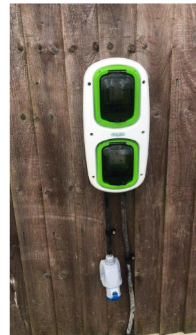
Electric vehicle charging point