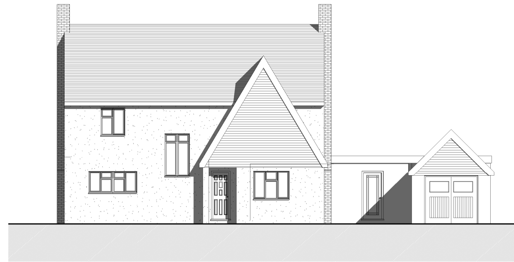
S Existing South Elevation 1:100