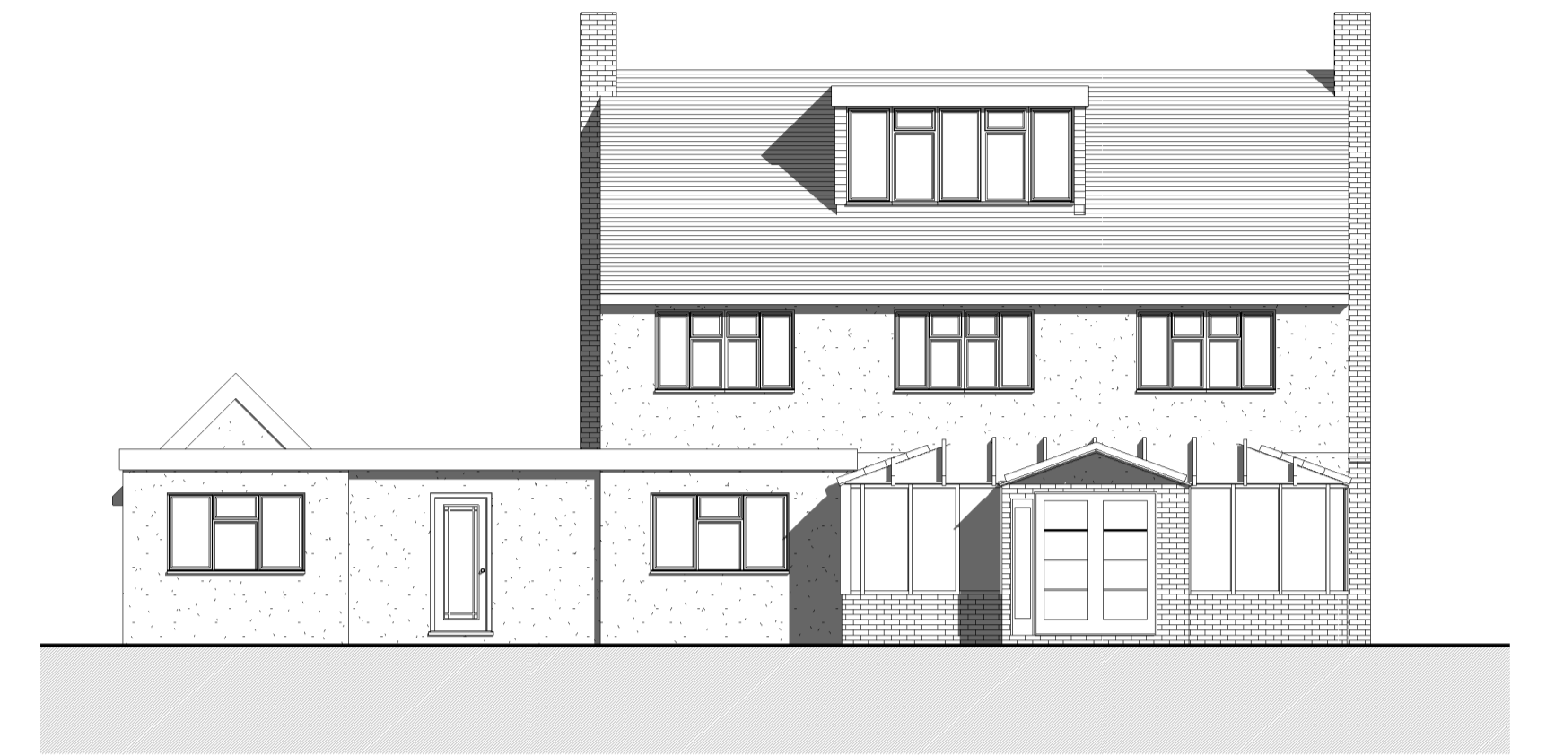
N Existing North Elevation 1:100