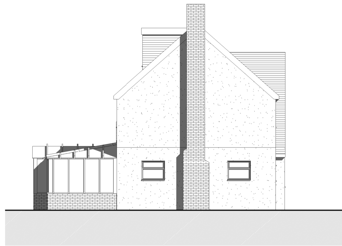
W Existing West Elevation 1:100