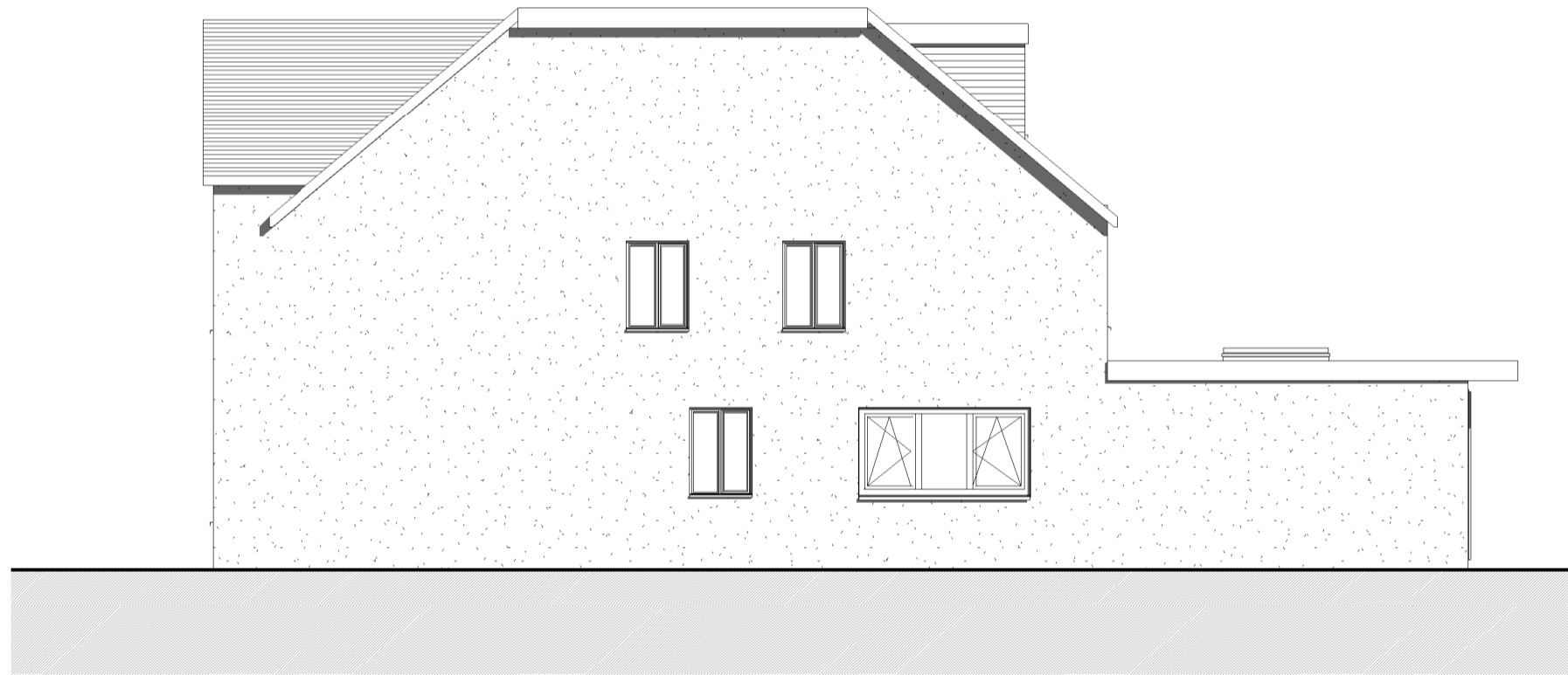
3 Proposed East Elevation 1:100