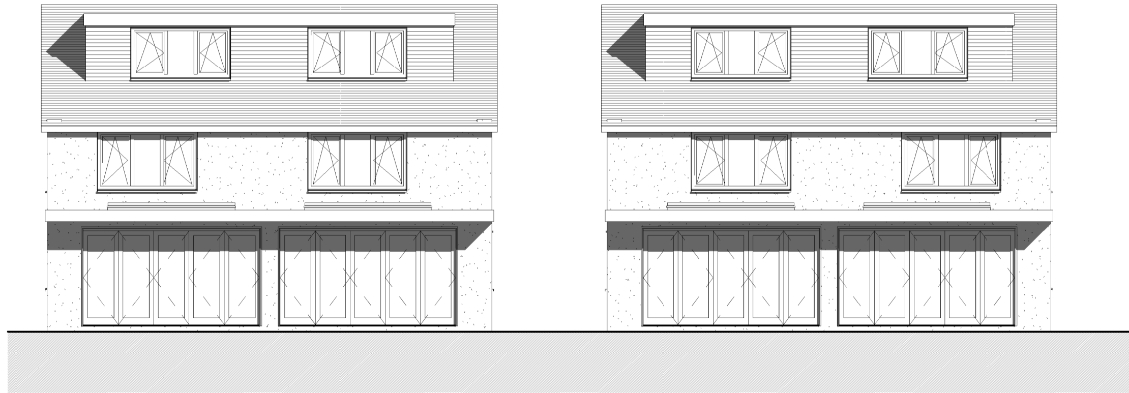
4 Proposed North Elevation 1:100