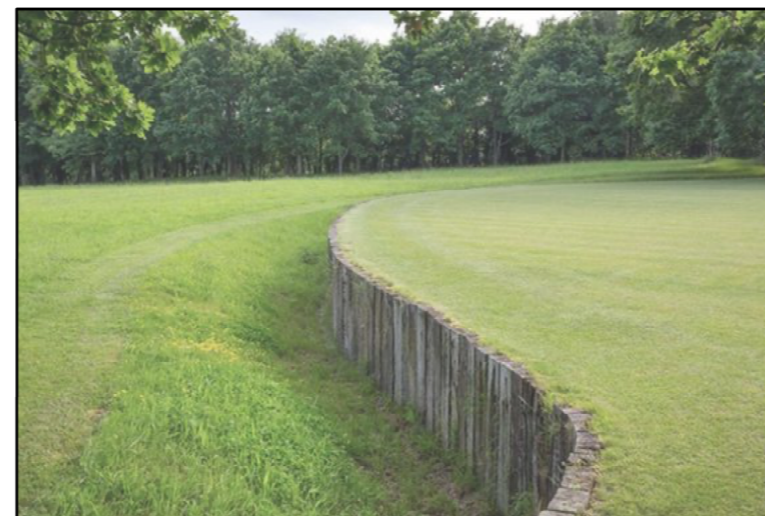
CURVED HA-HA BOUNDARY TREATMENT