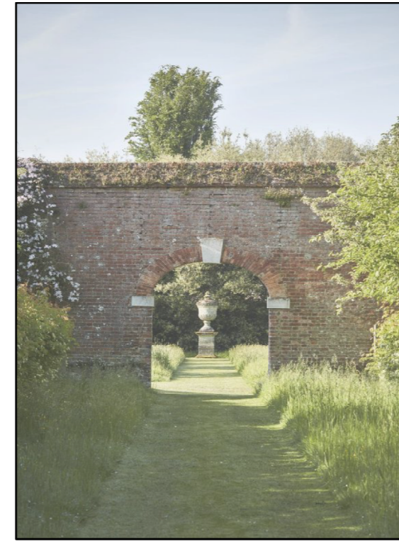
ARCHED WALLED GARDEN