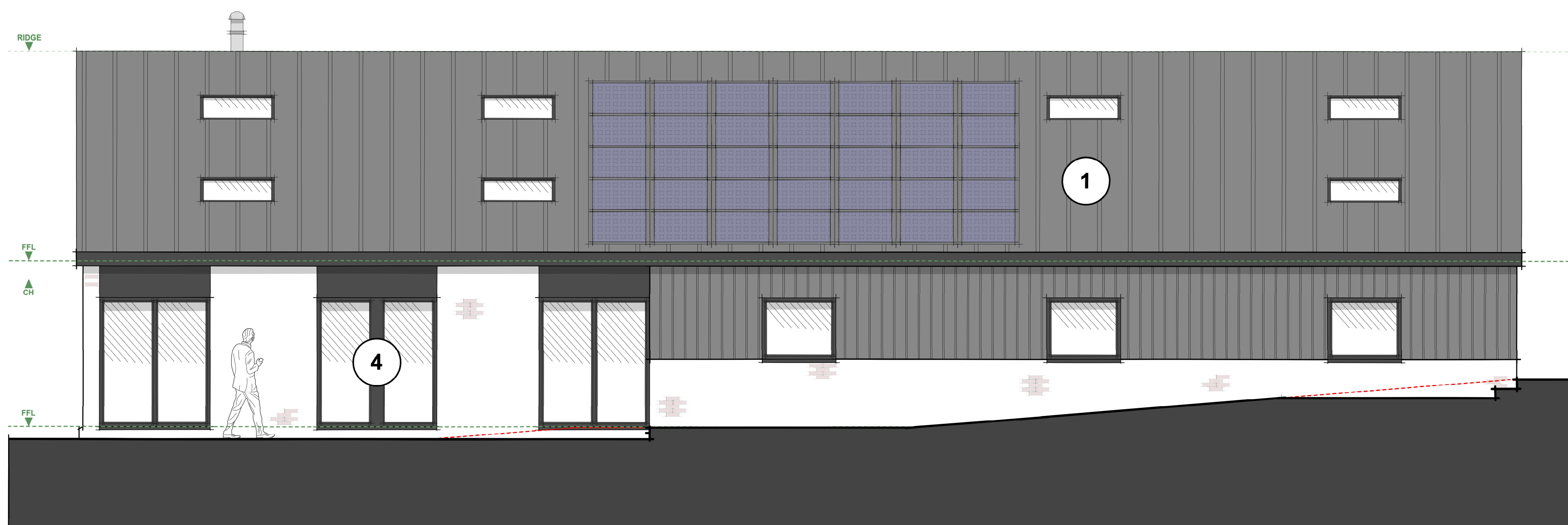
02 EAST ELEVATION Scale: 1:50 @ A1