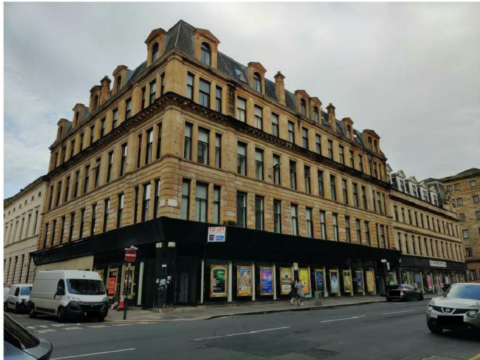
1. Whole building from Bell Street