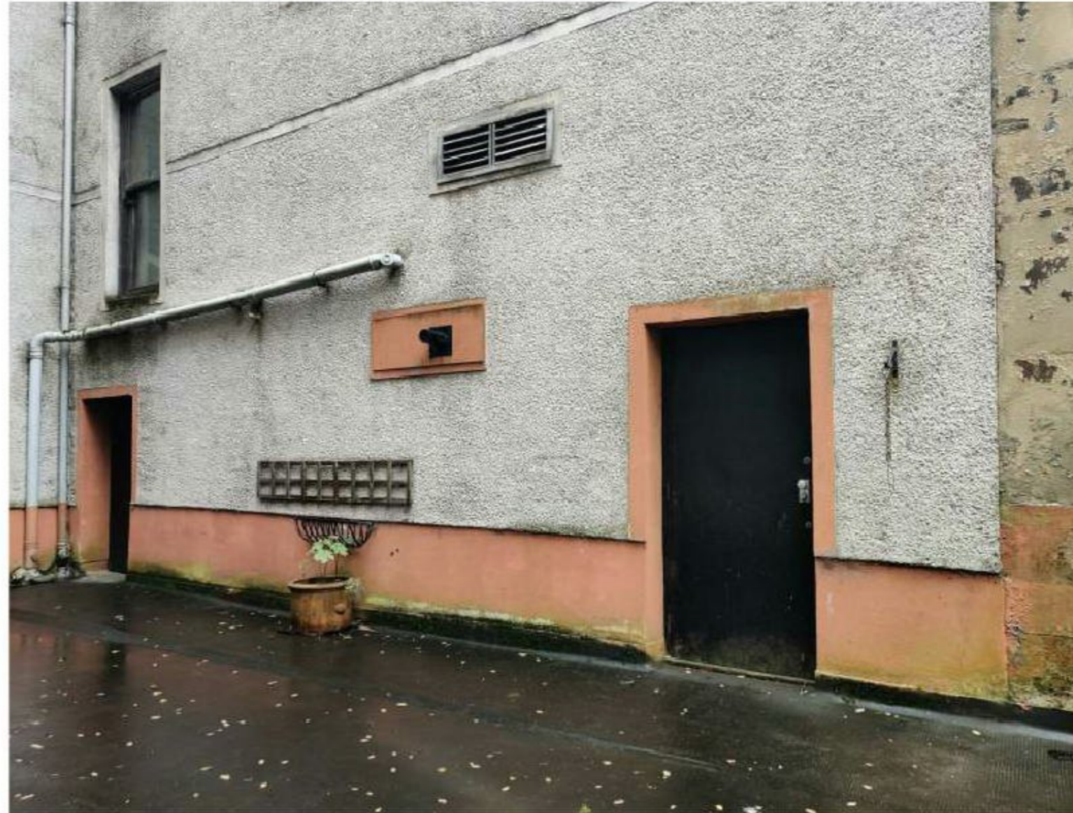
5. Rear courtyard elevation