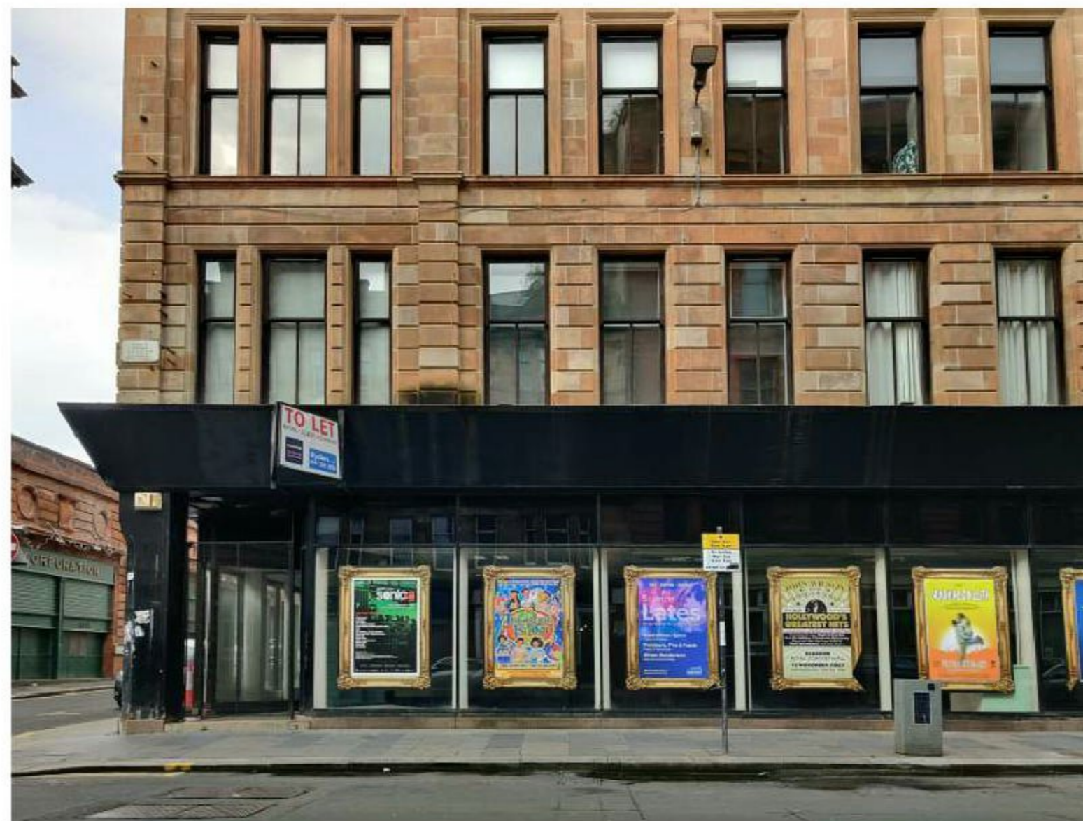
2. Bell Street frontage