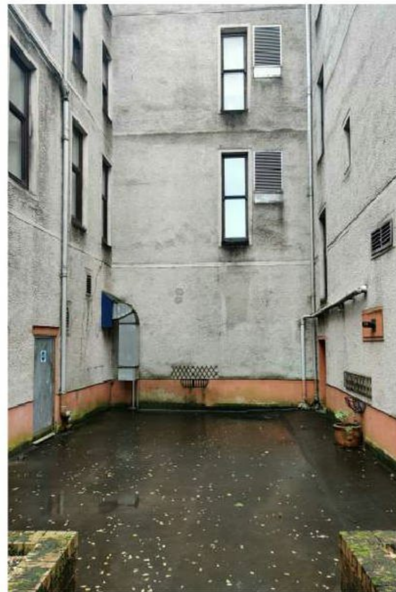
4. Rear courtyard space behind unit