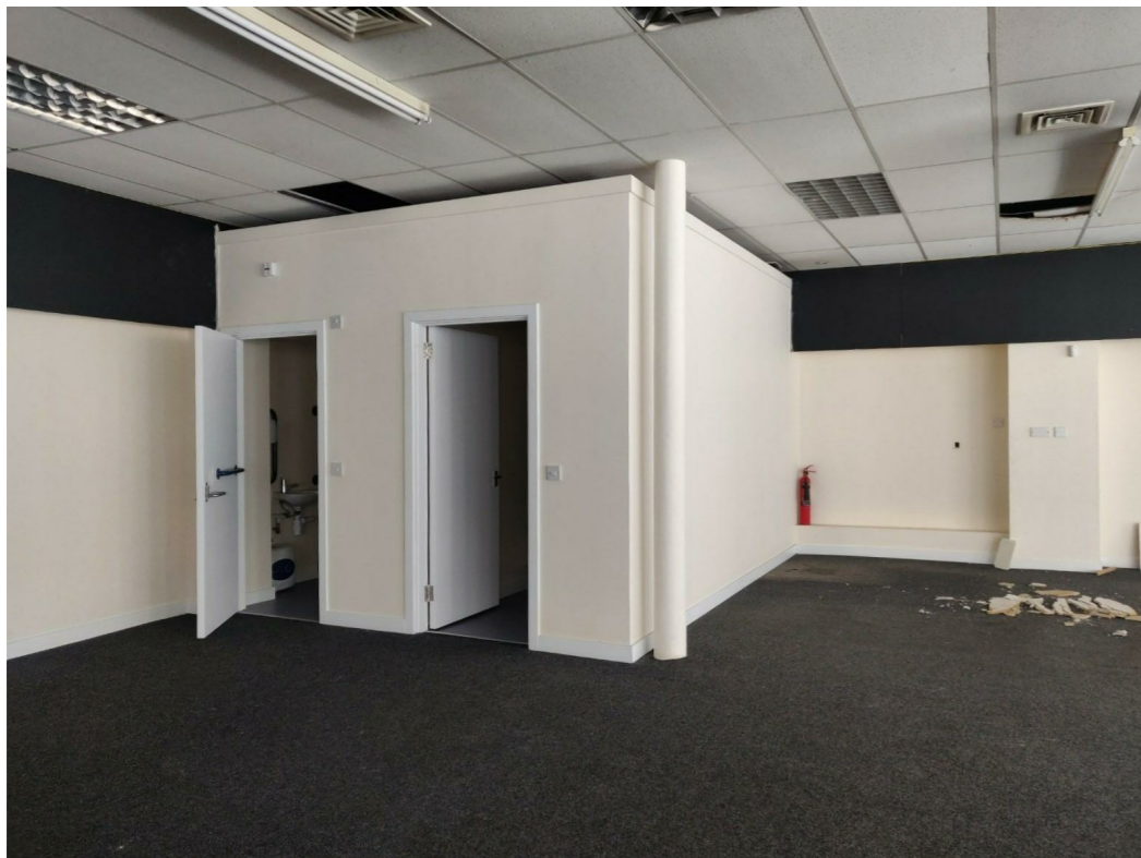
3. WC and Tea Prep Area