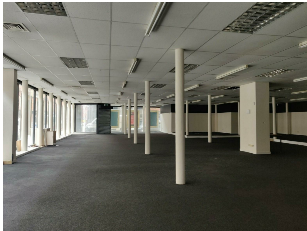
1. Main Shop Floor from Secondary Entrance