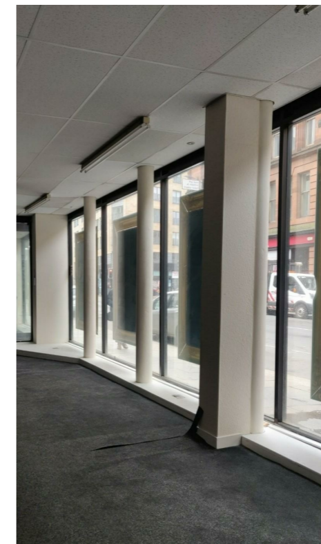
5. Window Units