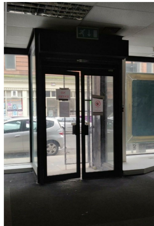
4. Existing Glazed Door Units