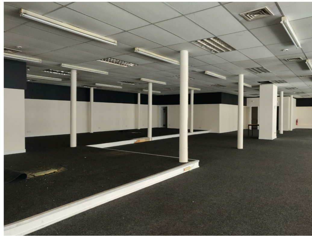
2. Main Shop Floor from Primary Entrance