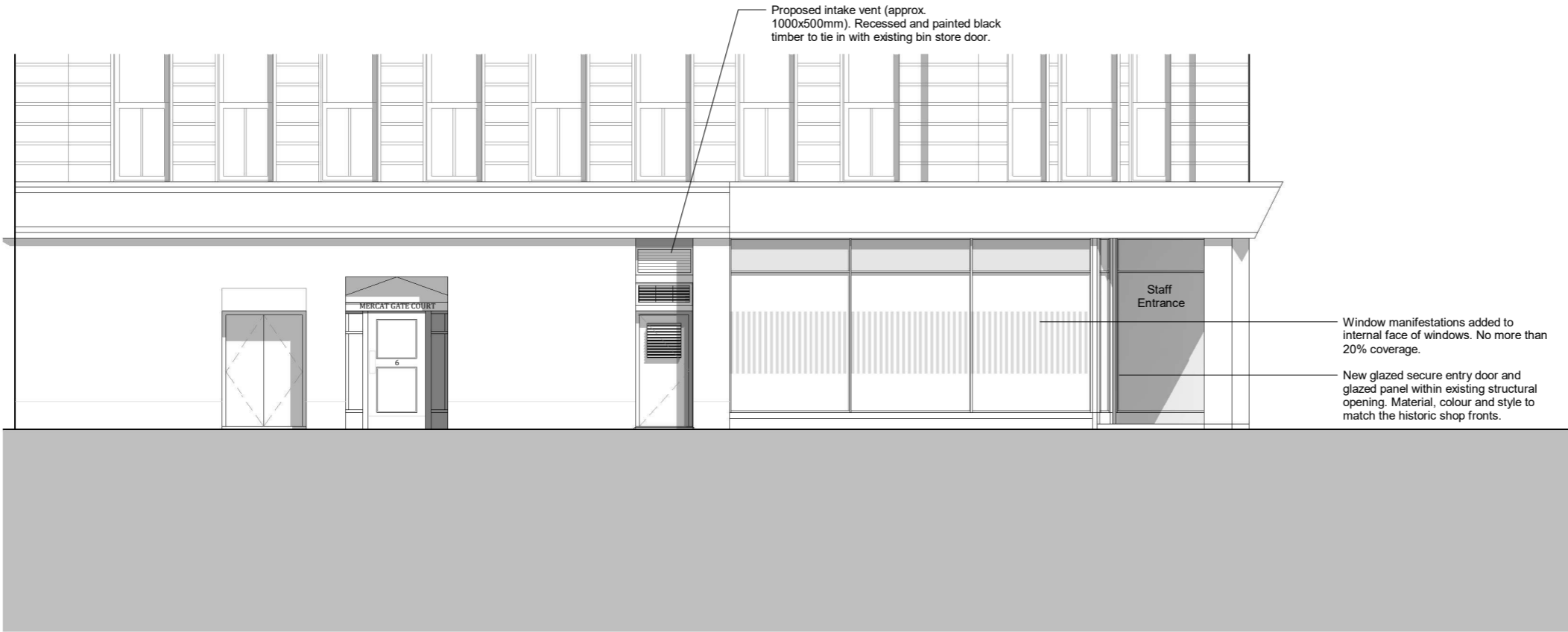
2. Walls Street Elevation