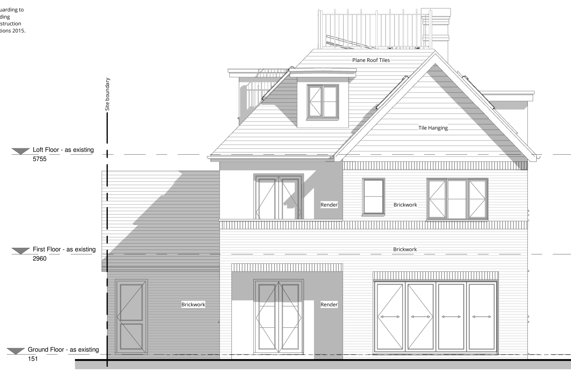
4 North Elevation - OP 1:50