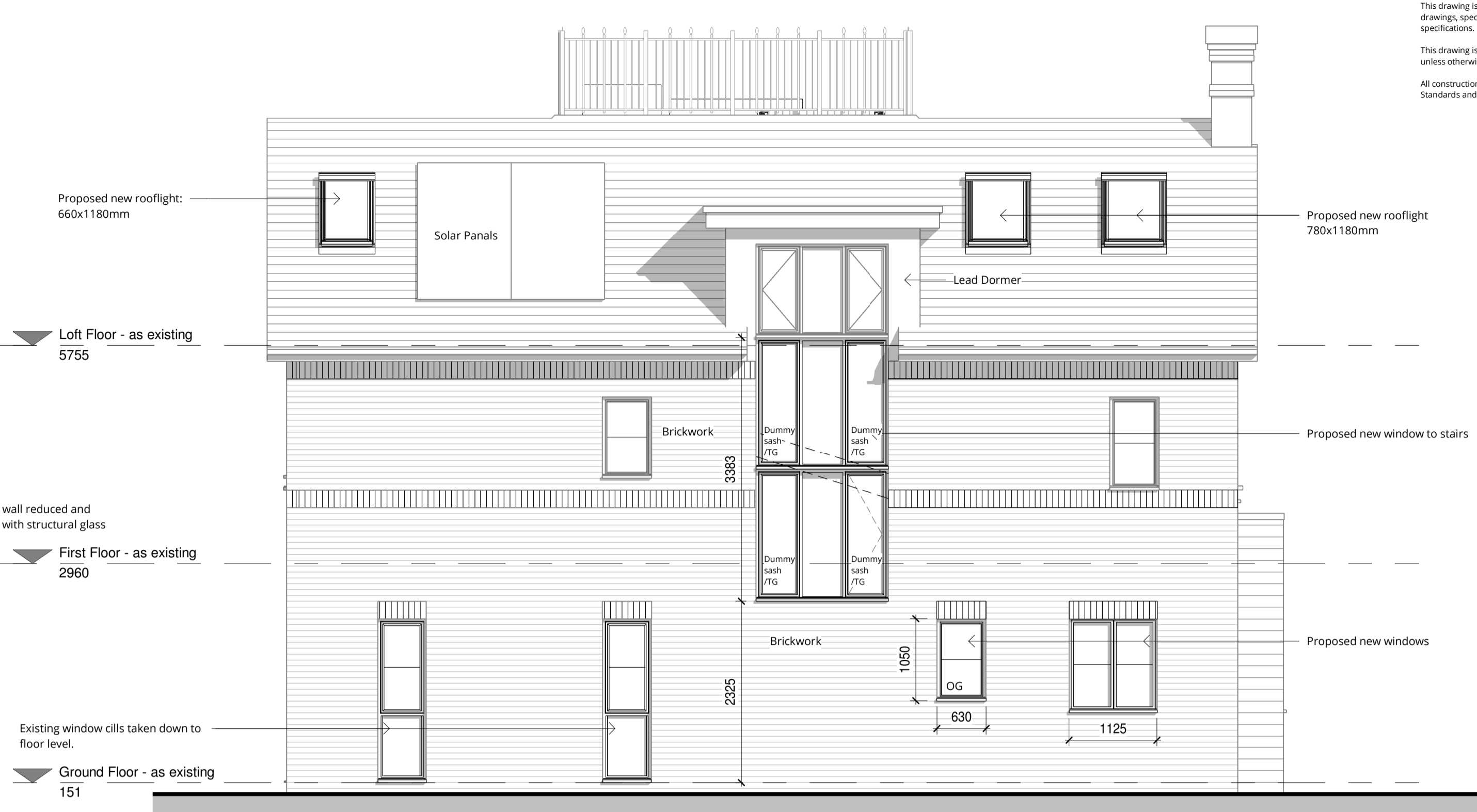
2 West Elevation - OP 1:50