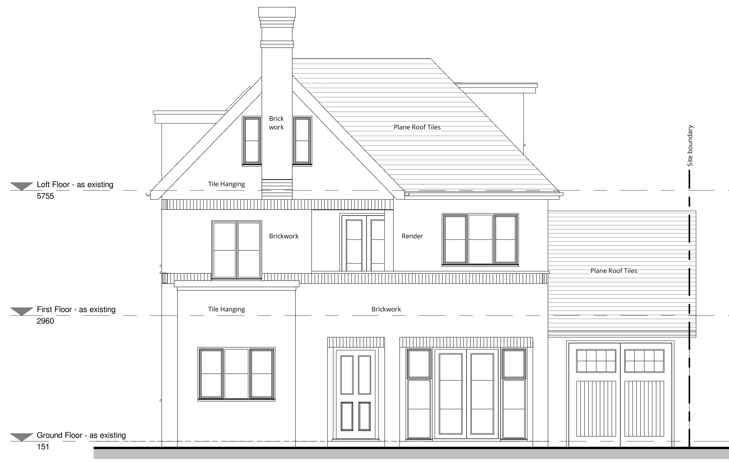
1 South Elevation 1:50

NOTE: All dimensions to be verified on site by the Contractor prior to the commencement of any work or the production of any fabrication drawings. All discrepancies to be immediately reported to the Contract Administrator. This drawing is to be read in conjunction with all other relevant GFW Design + Architecture Ltd drawings, specification of works and all other appointed consultants drawings and specifications. This drawing is the property of GFW Design + Architecture Ltd. Copyright is reserved by them unless otherwise agreed by written consent of GFW Design + Architecture Ltd. All construction work to comply with Local Authority codes and Building Regulations, British Standards and other regulations applicable to both design and execution of the work.