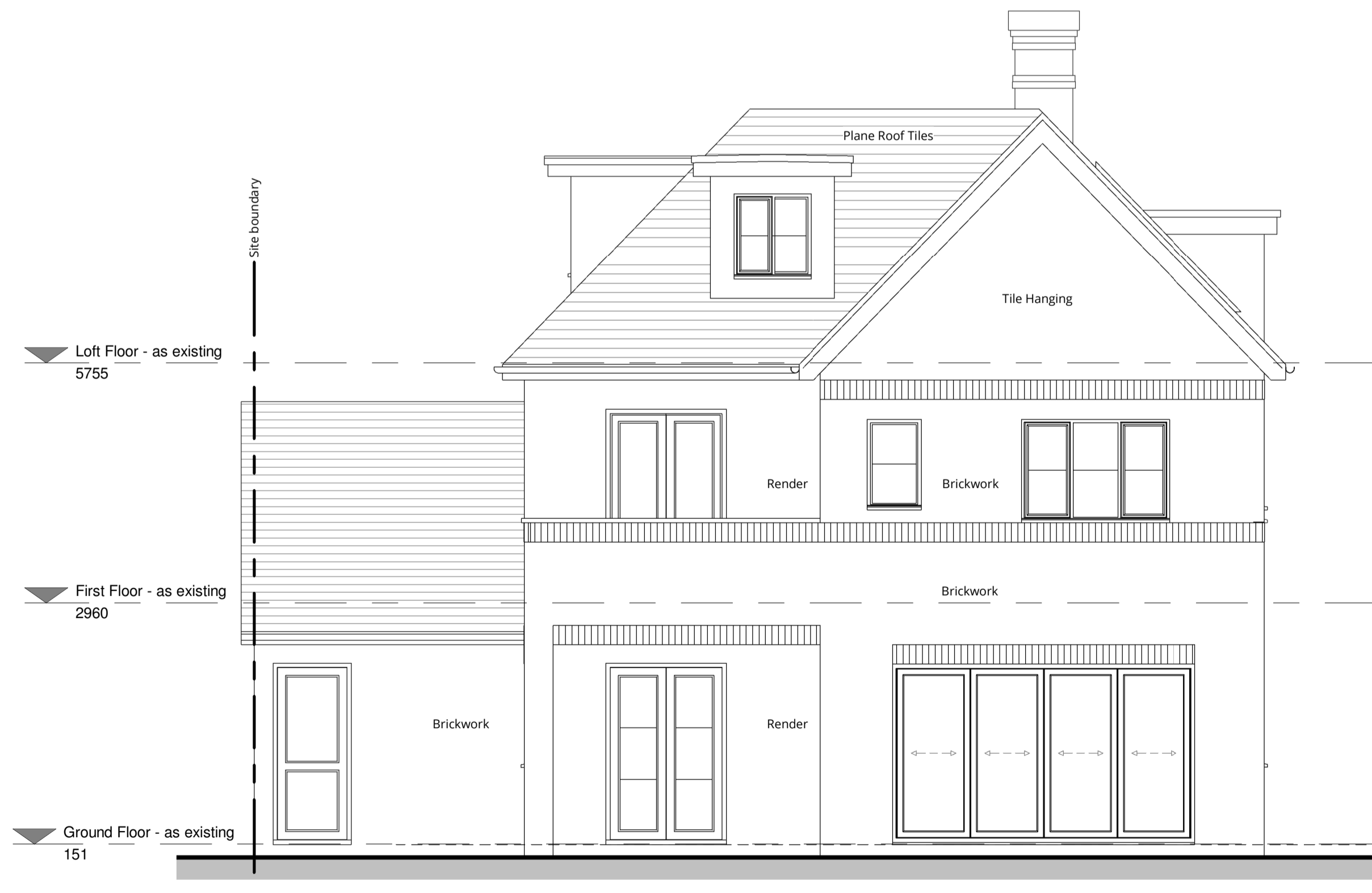
4 North Elevation 1:50