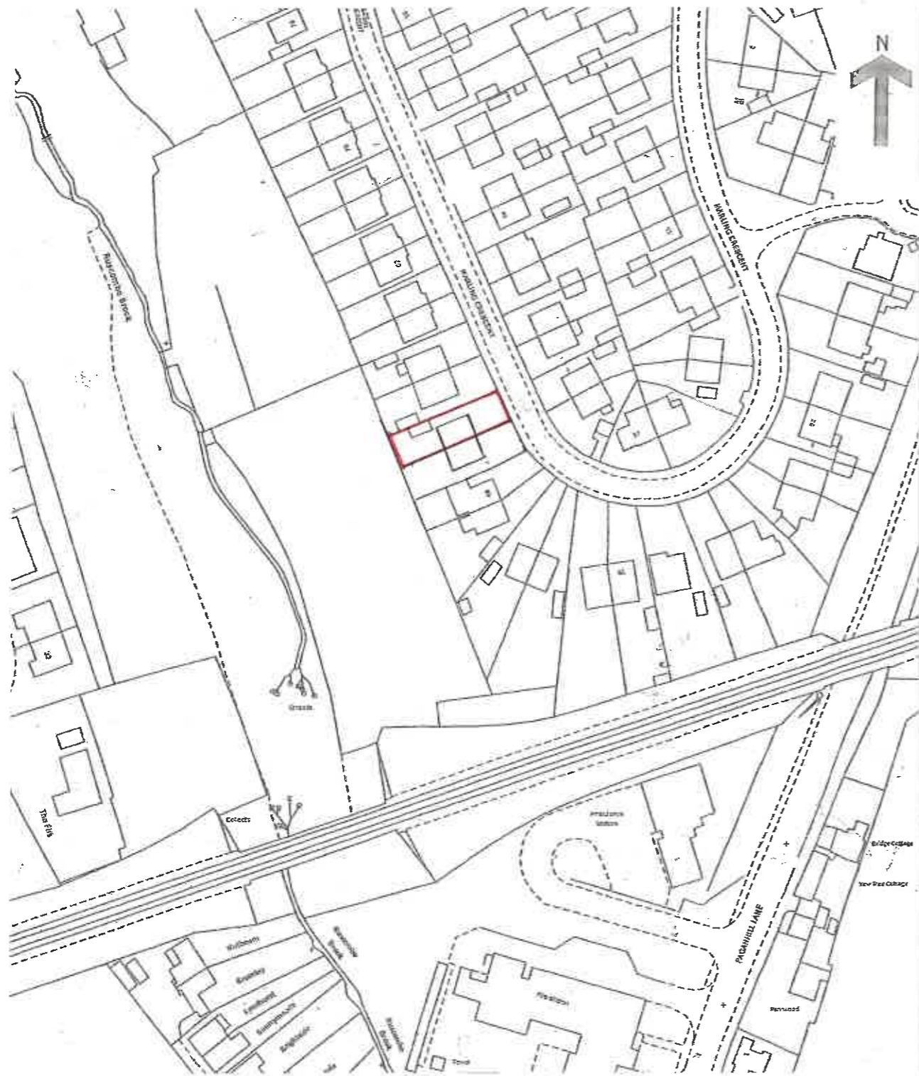
LOCATION PLAN: (Scale -1:1250 @ A.3)