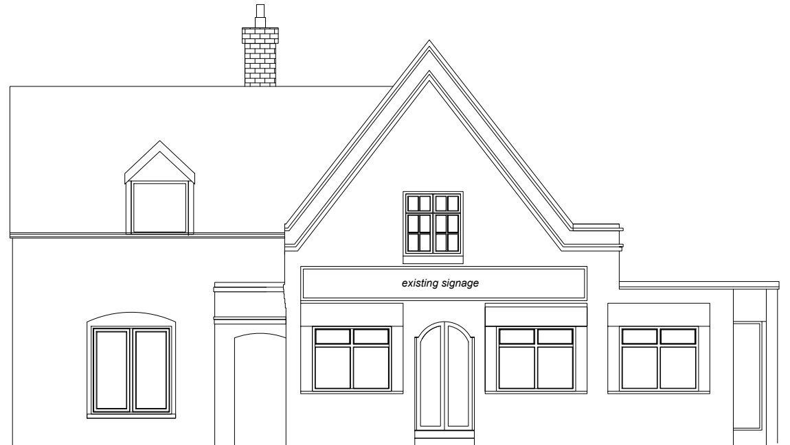
PROPOSED FRONT ELEVATION - AS APPROVED UNDER APPLICATION NO. PL/2022/01894/MINFOT

ELEVATIONS AS APPROVED UNDER APPLICATION NUMBER: PL/2022/01894/MINFOT