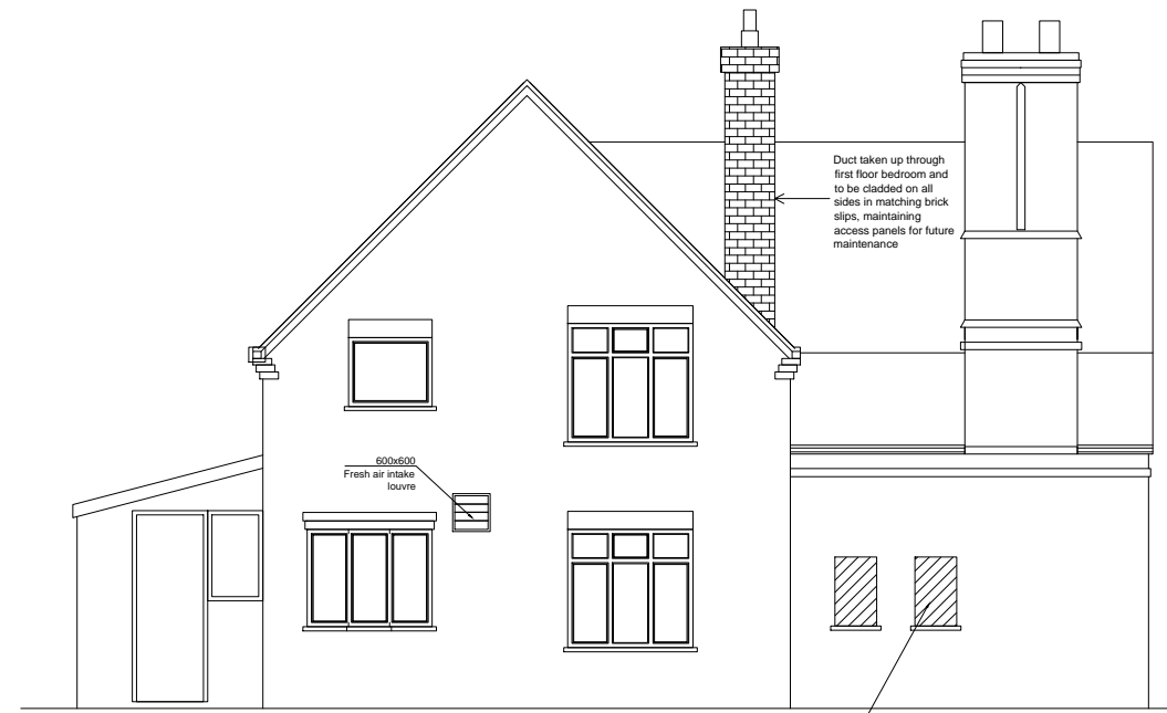
PROPOSED REAR ELEVATION - AS APPROVED UNDER APPLICATION NO. PL/2022/01894/MINFOT