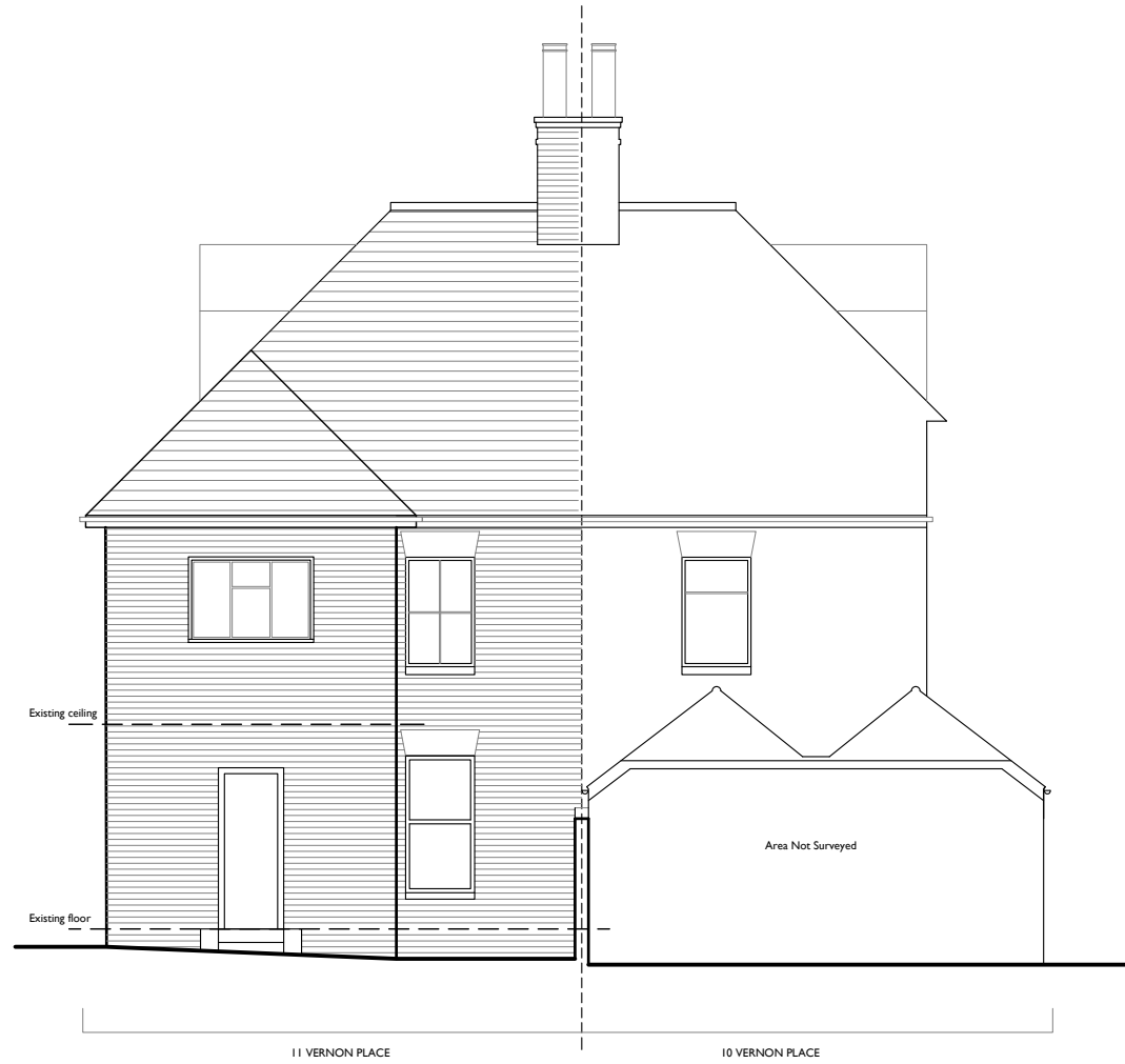
Existing Rear Elevation (North West)