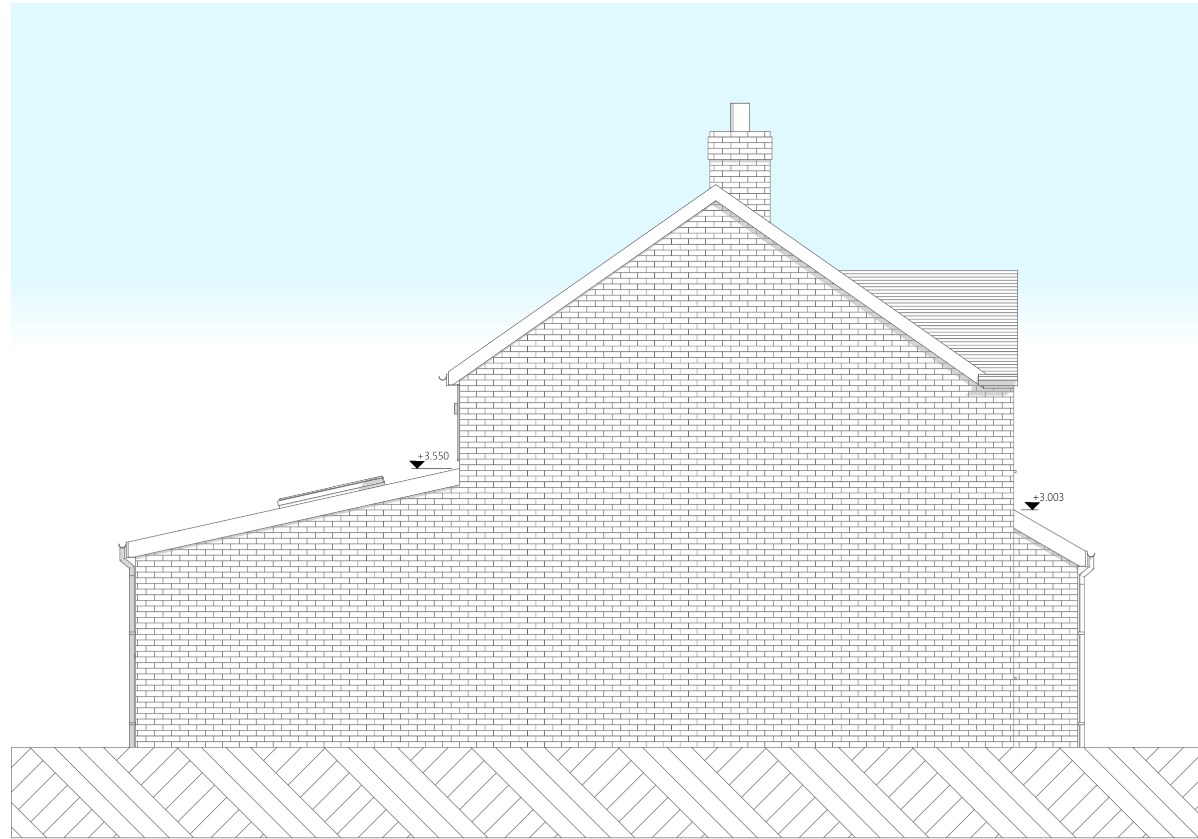
Proposed Side Elevation SW 1:50