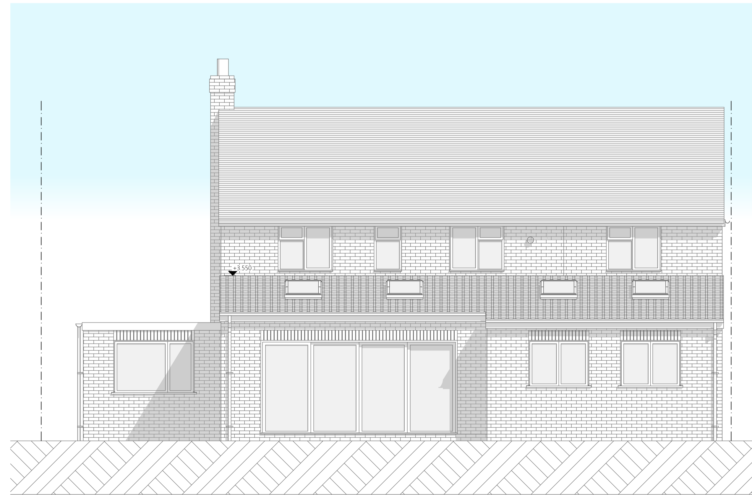
Proposed Rear Elevation NW 1:50