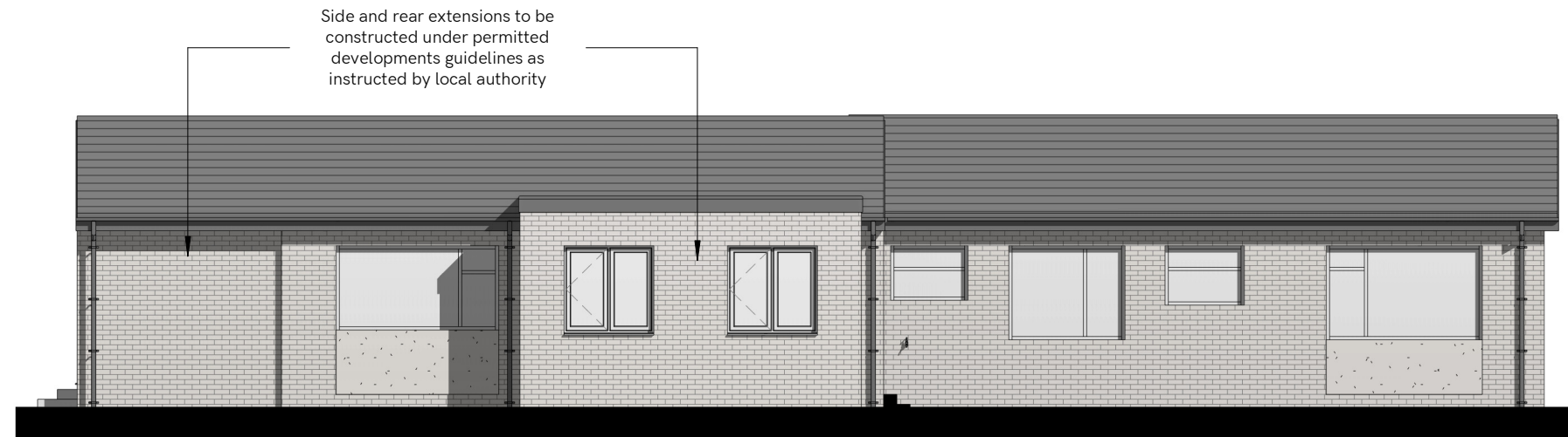
Rear 1 : 100