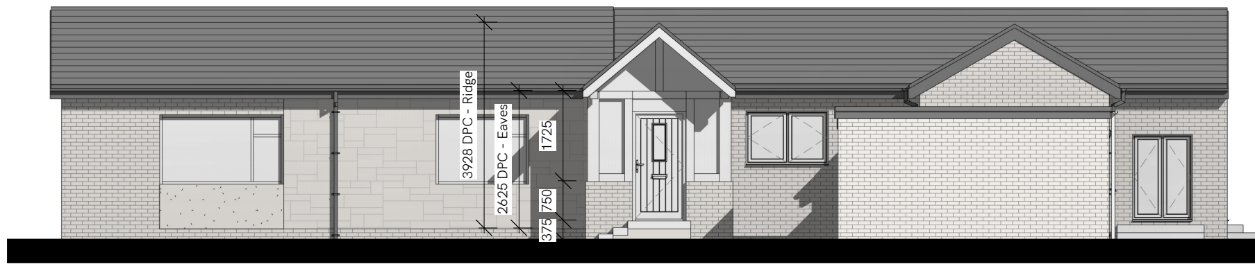
Front 1 : 100

NOTE: Do not scale from this drawing. This drawing is copyright of Ergo Projects Ltd. All dimensions to be checked prior to any work commencing. Any discrepancies to be reported to Ergo Projects immediately.