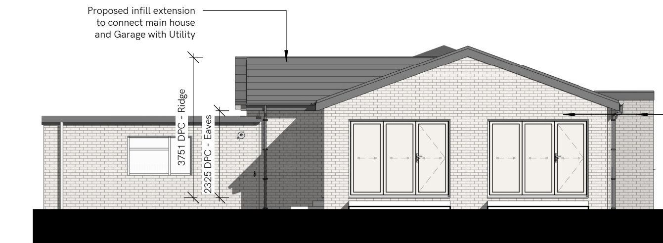
Right 1 : 100

Side and rear extensions to be constructed under permitted developments guidelines as instructed by local authority