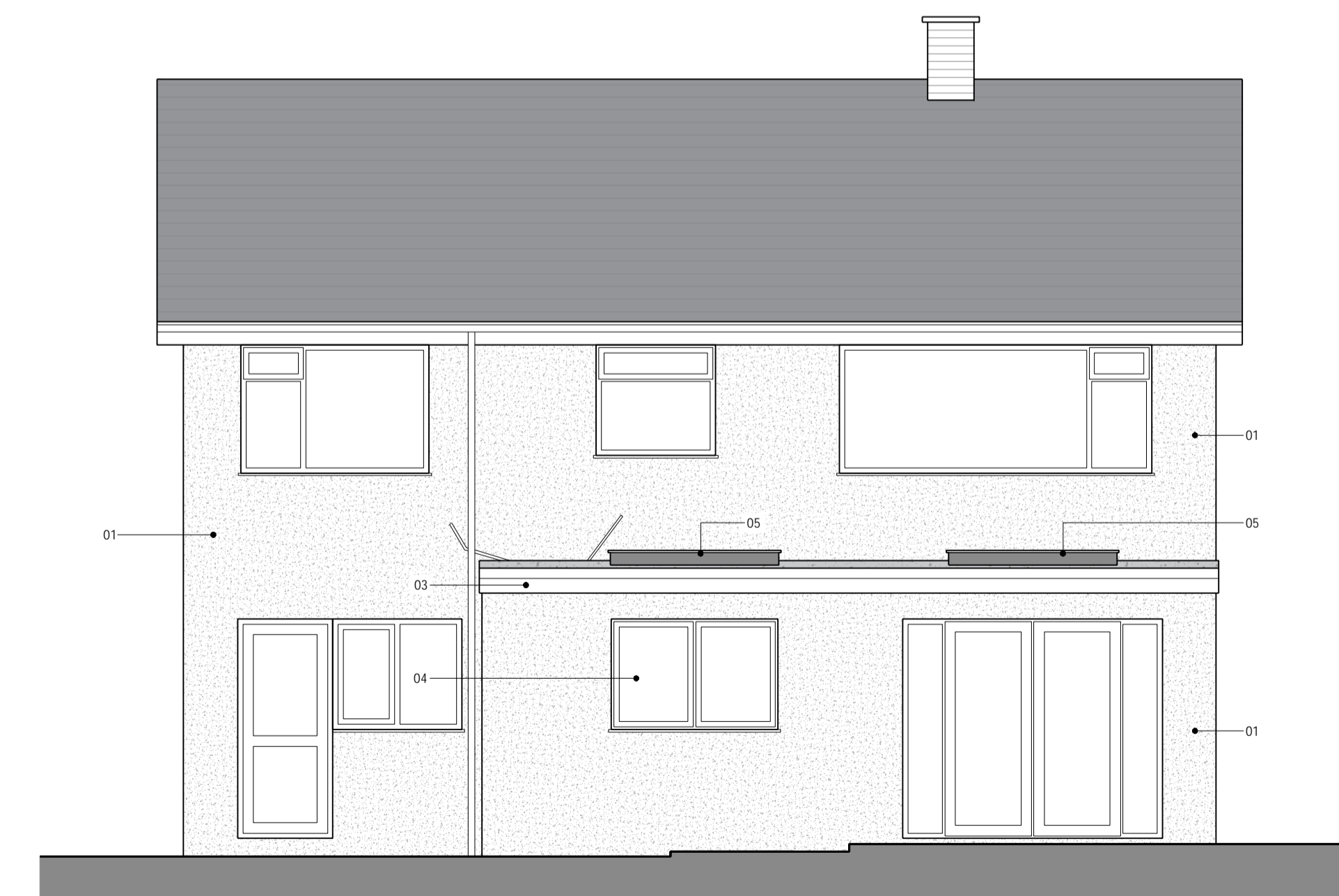
Rear Elevation: 1:50 @ A1 0m 0.5m 1m 2.5m