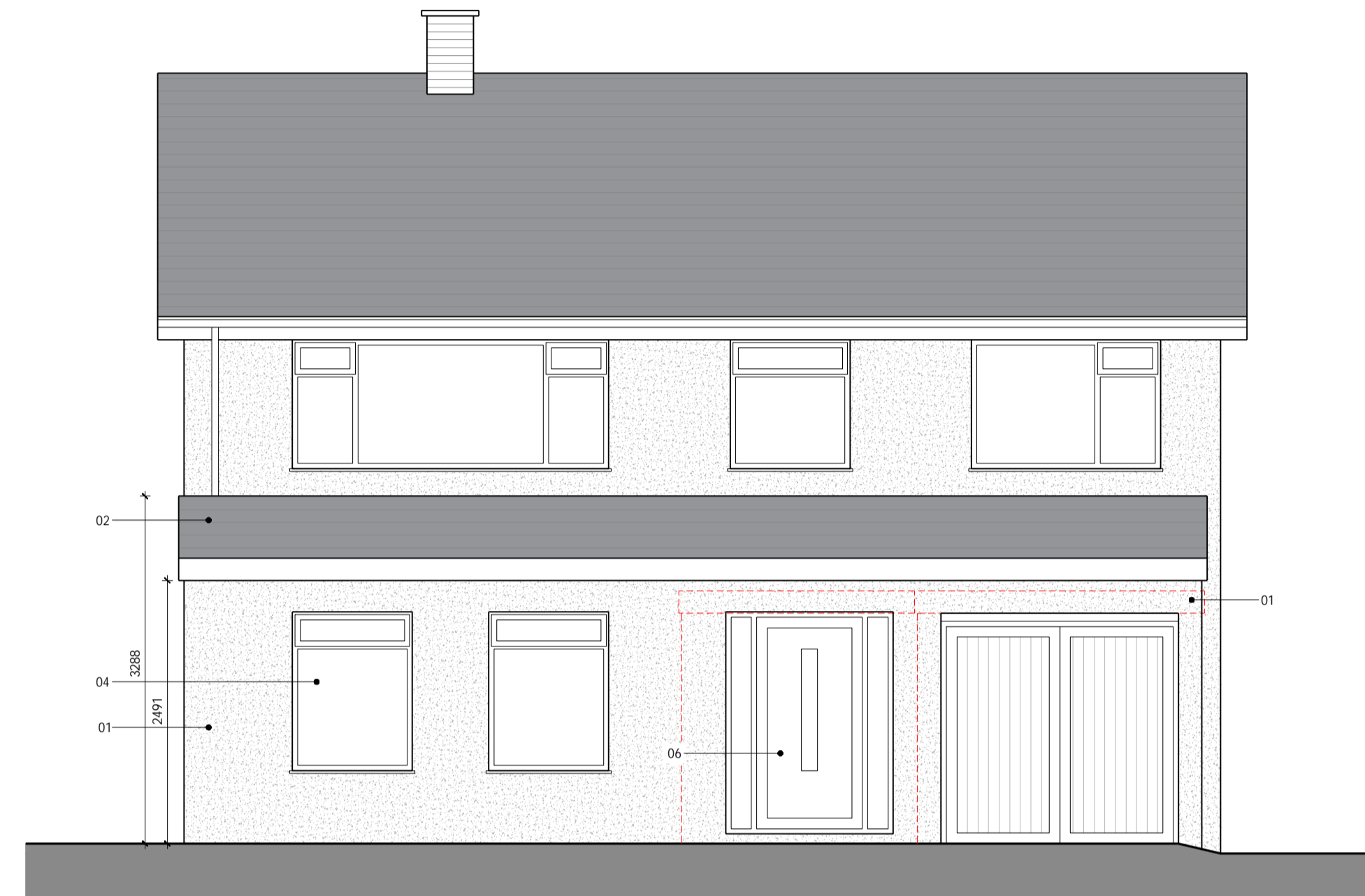
Front Elevation: 1:50 @ A1 0m 0.5m 1m 2.5m