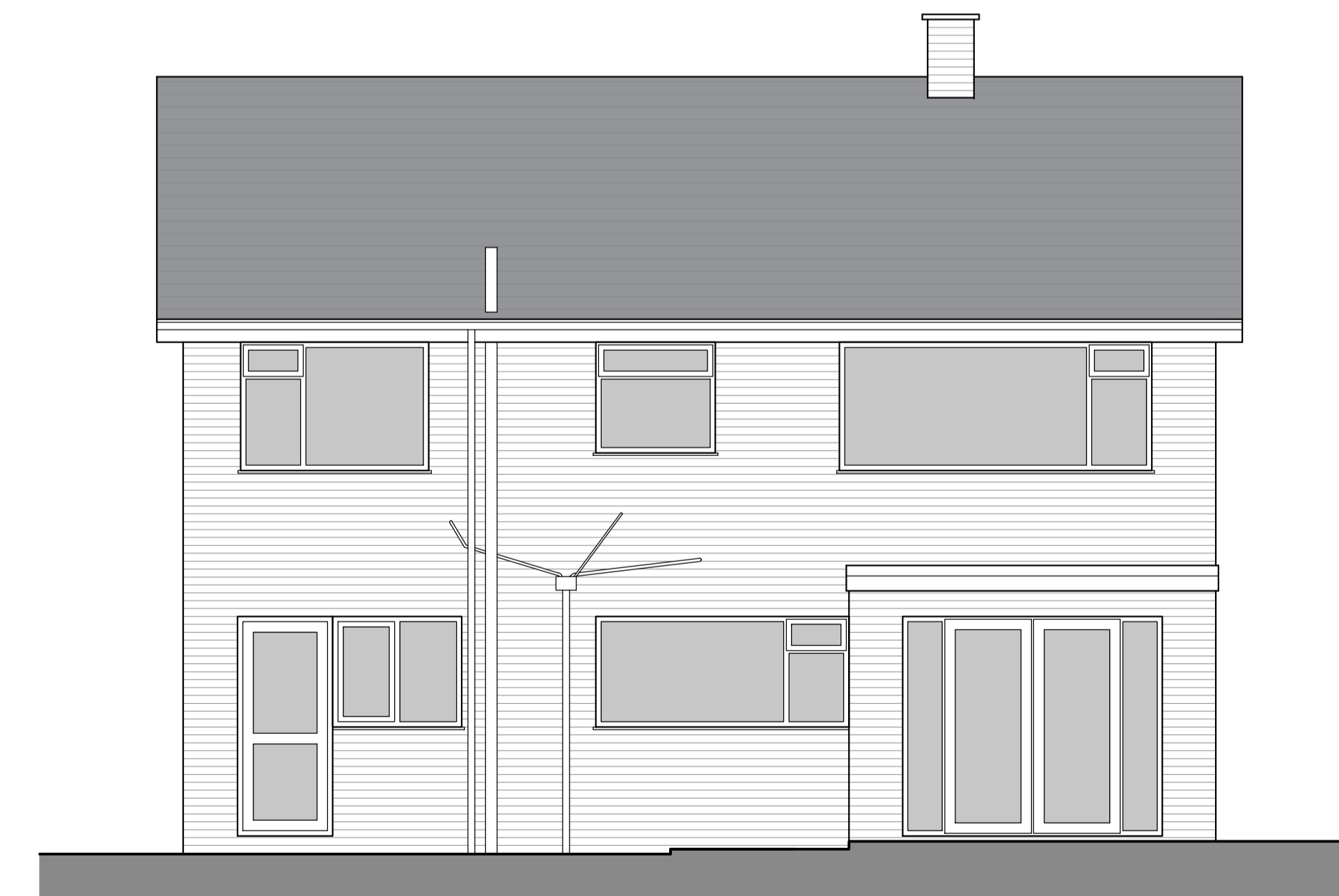
Rear Elevation: 1:50 at A1 0m 0.5m 1m 2.5m