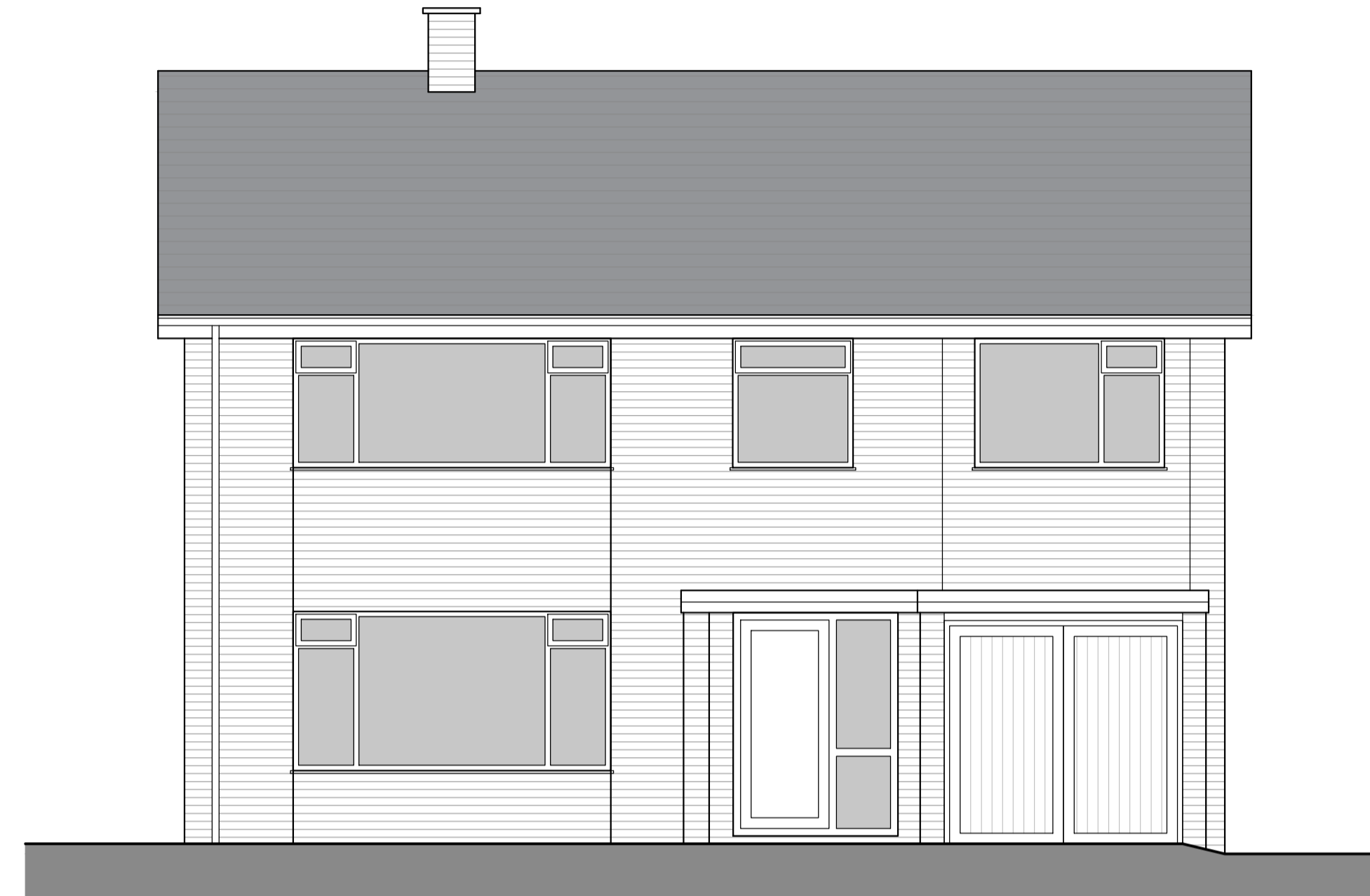
Front Elevation: 1:50 at A1 0m 0.5m 1m 2.5m