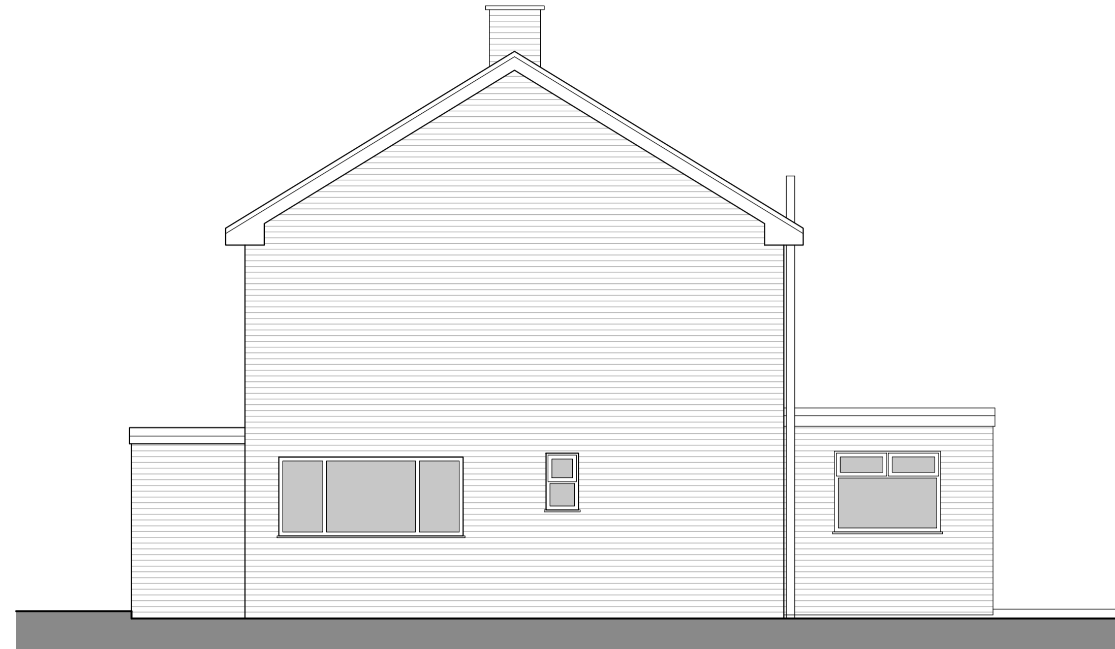
Side Elevation: RHS 1:50 at A1 0m 0.5m 1m 2.5m