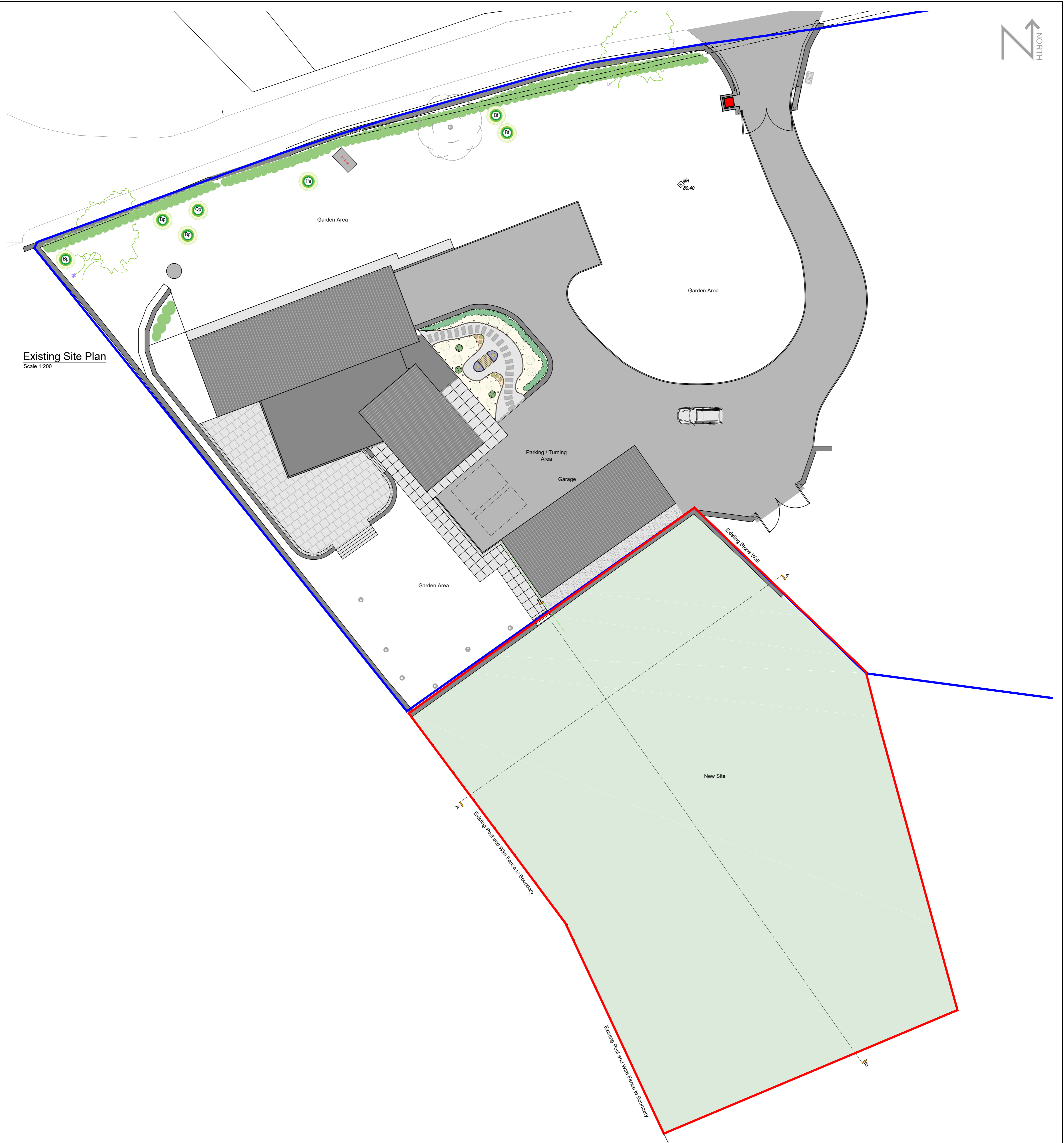
Existing Site Plan Scale 1:200