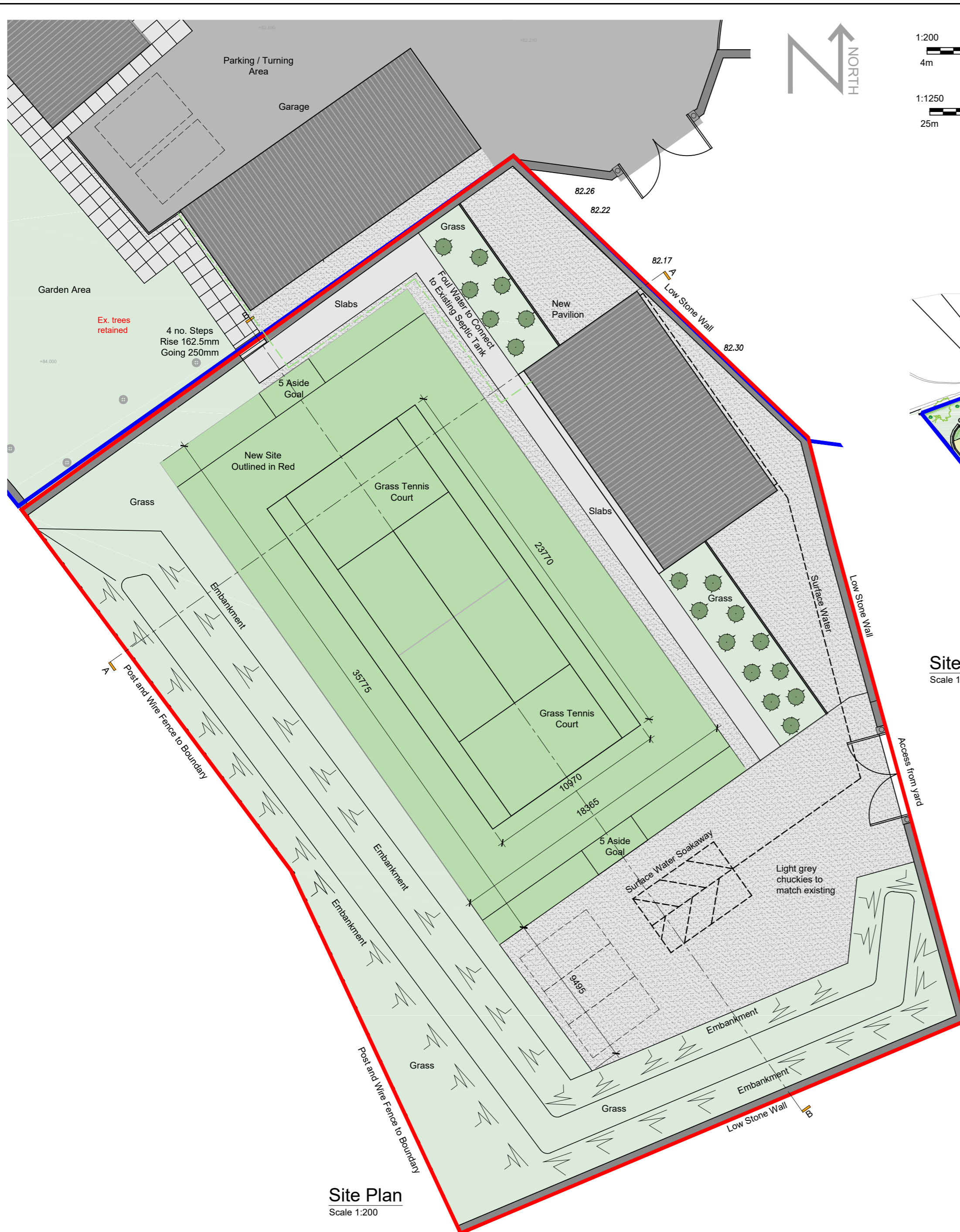
Site Plan Scale 1:200