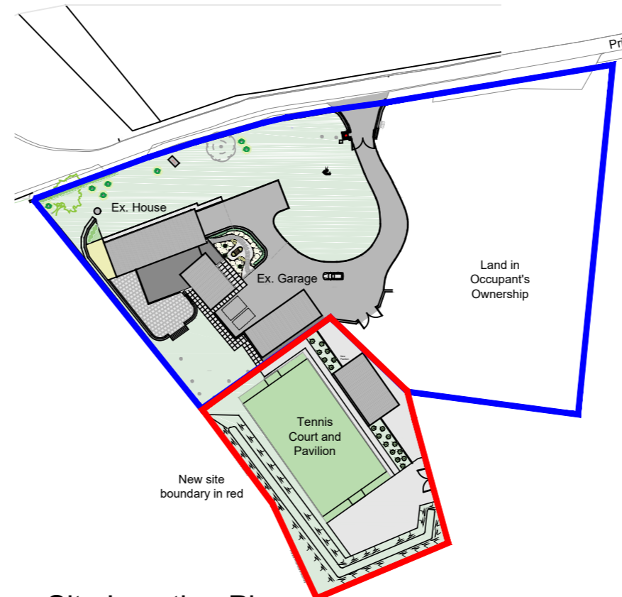
Site Location Plan Scale 1:1250