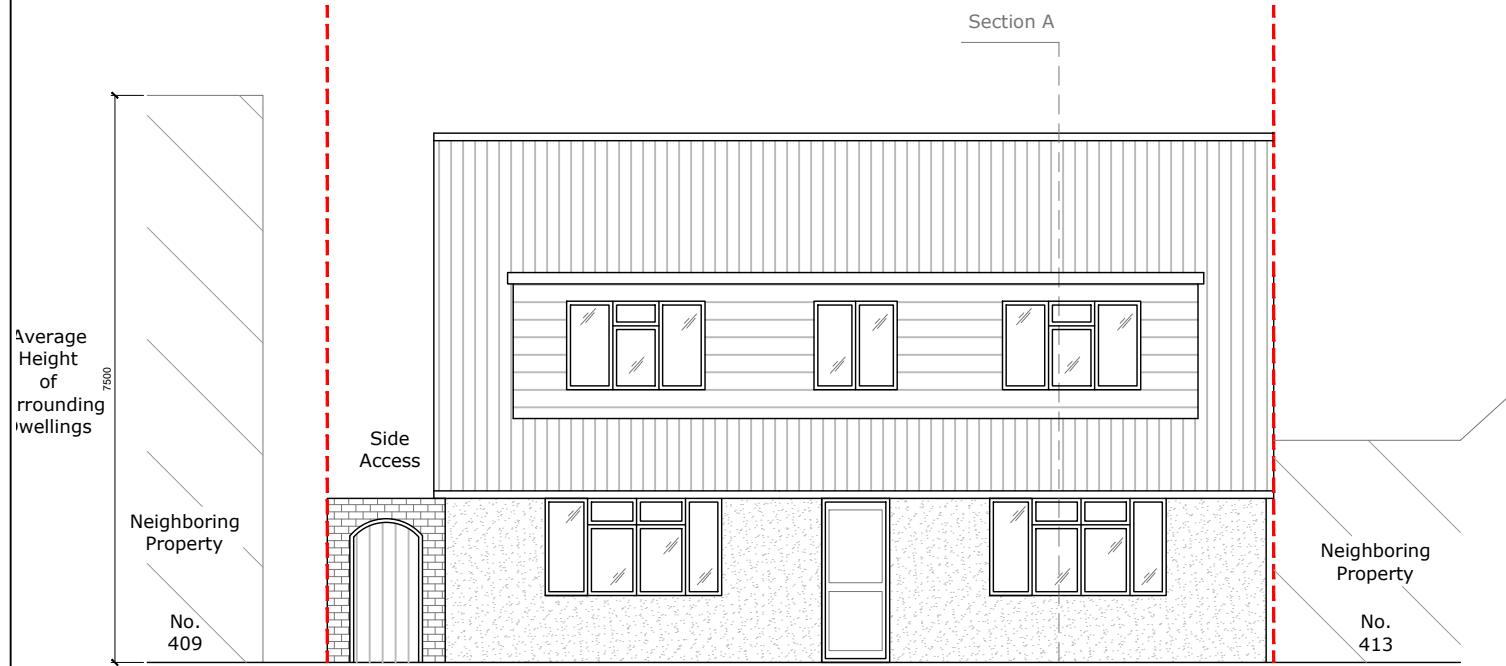
1 Existing Front Elevation 1:100 - East Elevation