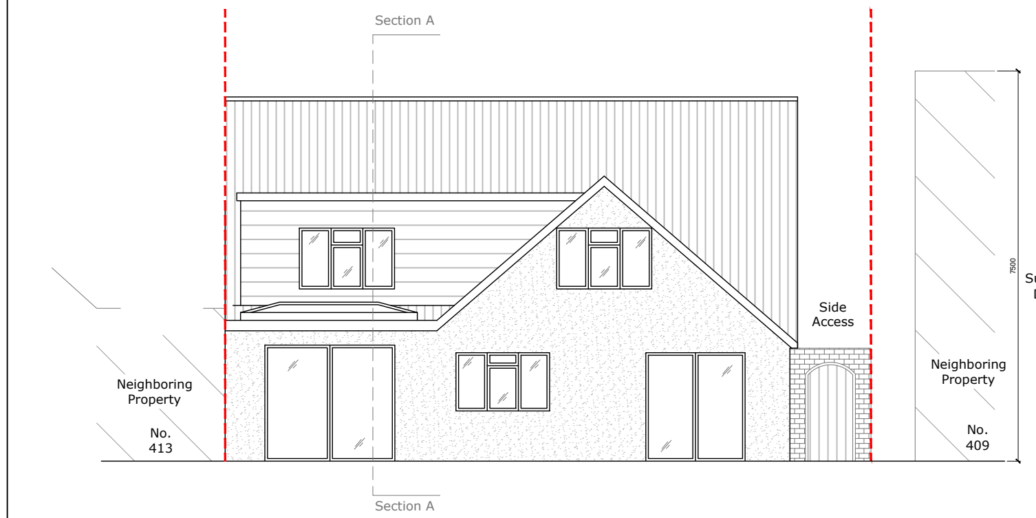
3 Existing Rear Elevation 1:100 - West Elevation