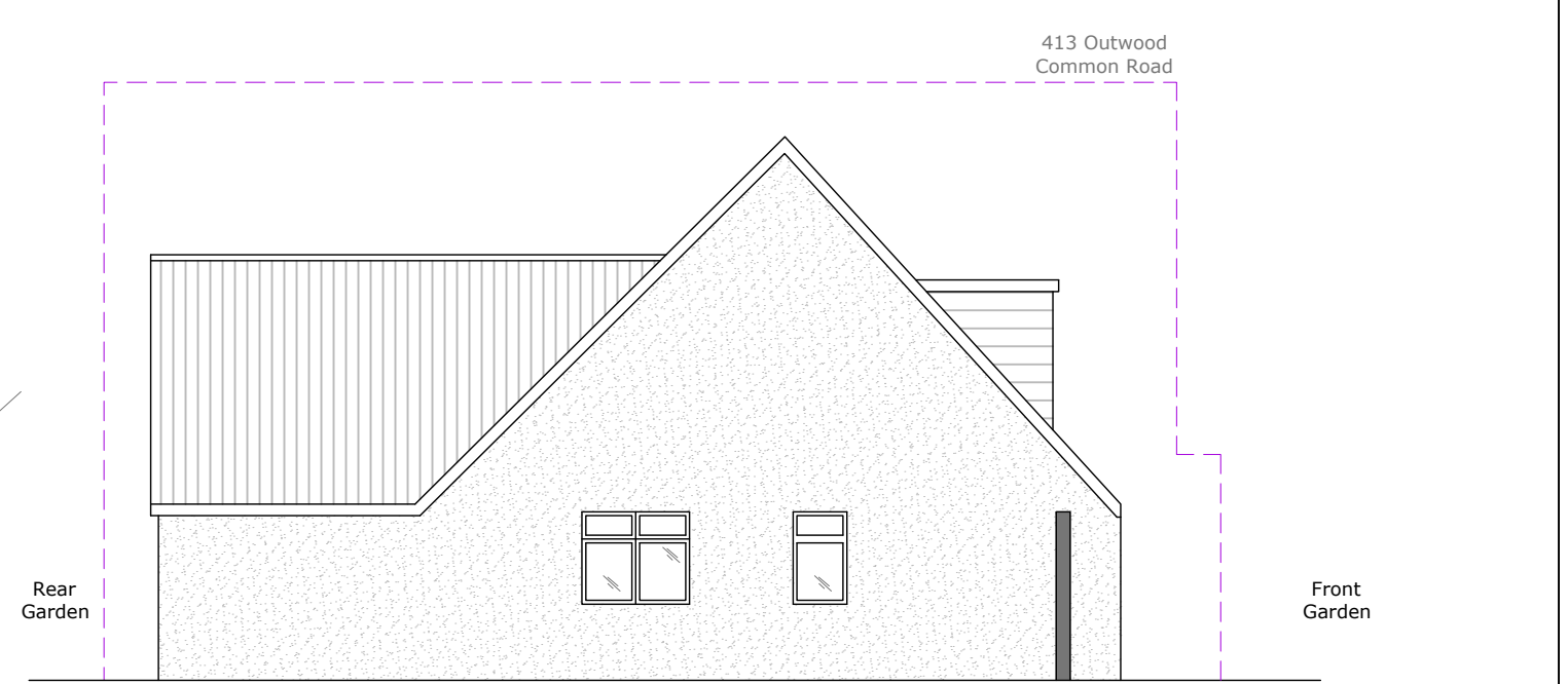
2 Existing Side Elevation 1:100 - Rear to Front