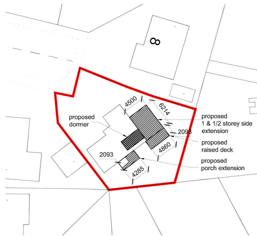
1:500 Block Plan Proposed