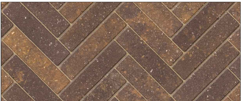
Proposed driveway block paviours