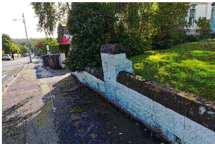
Front boundary wall looking east.