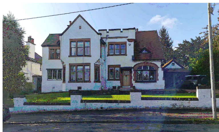
Front of house showing boundary wall and wall within garden