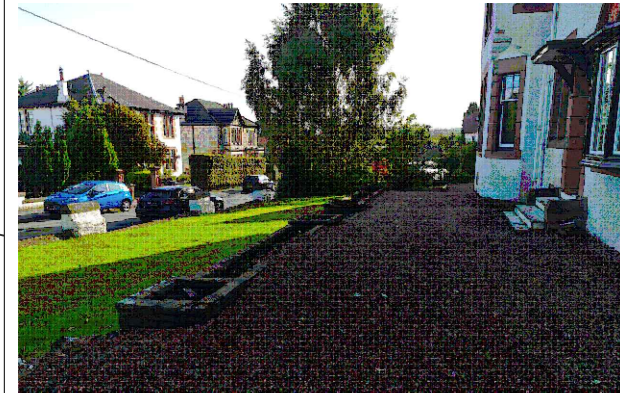
Front of house showing driveway and internal garden wall