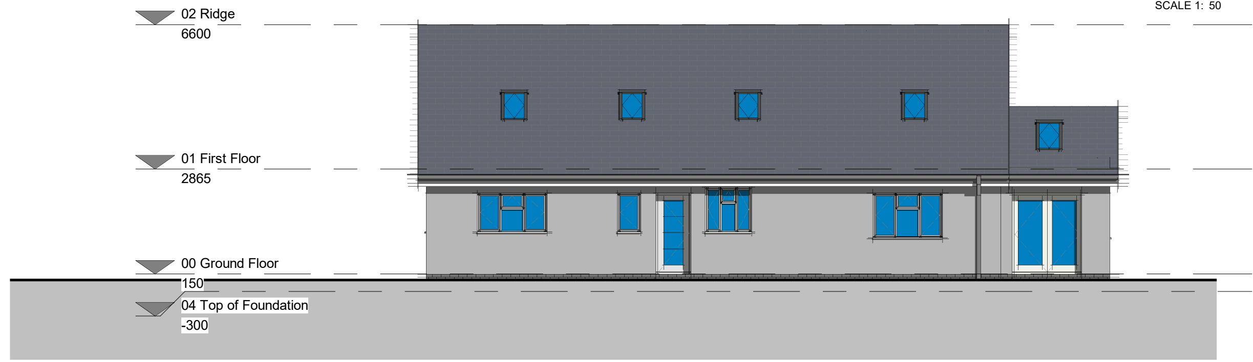
1 Rear Elevation 1 : 100