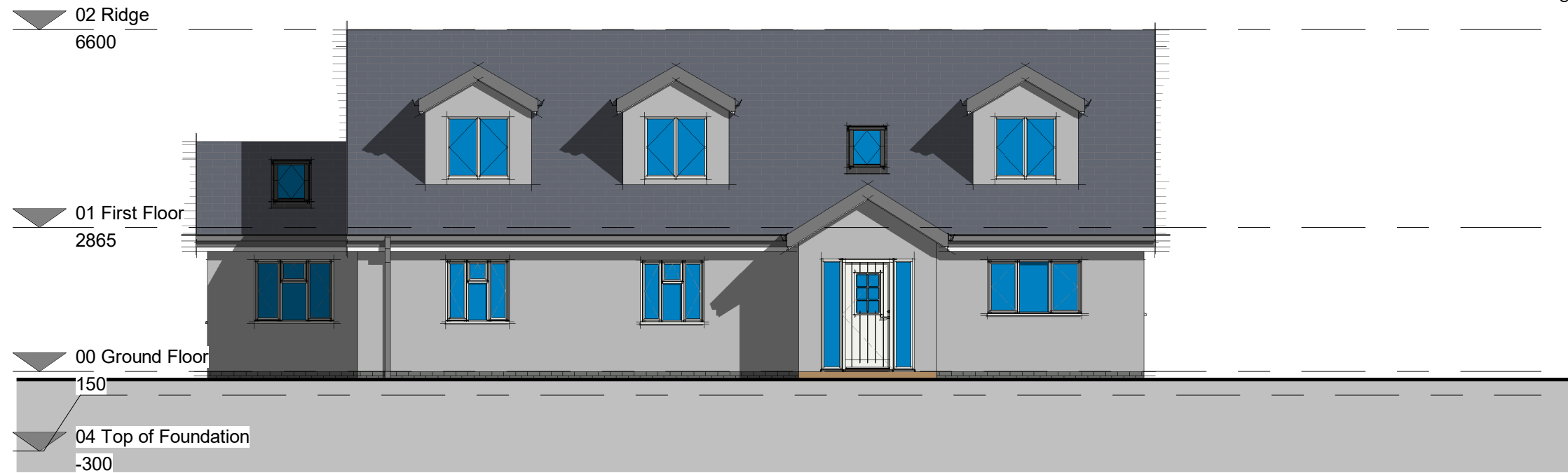
1 Front Elevation 1 : 100