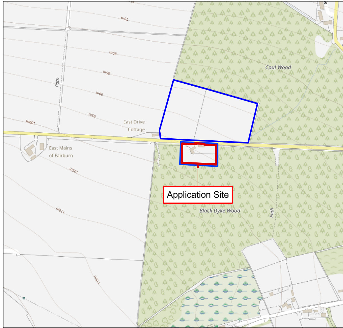
BLOCK PLAN Scale: 1:5000