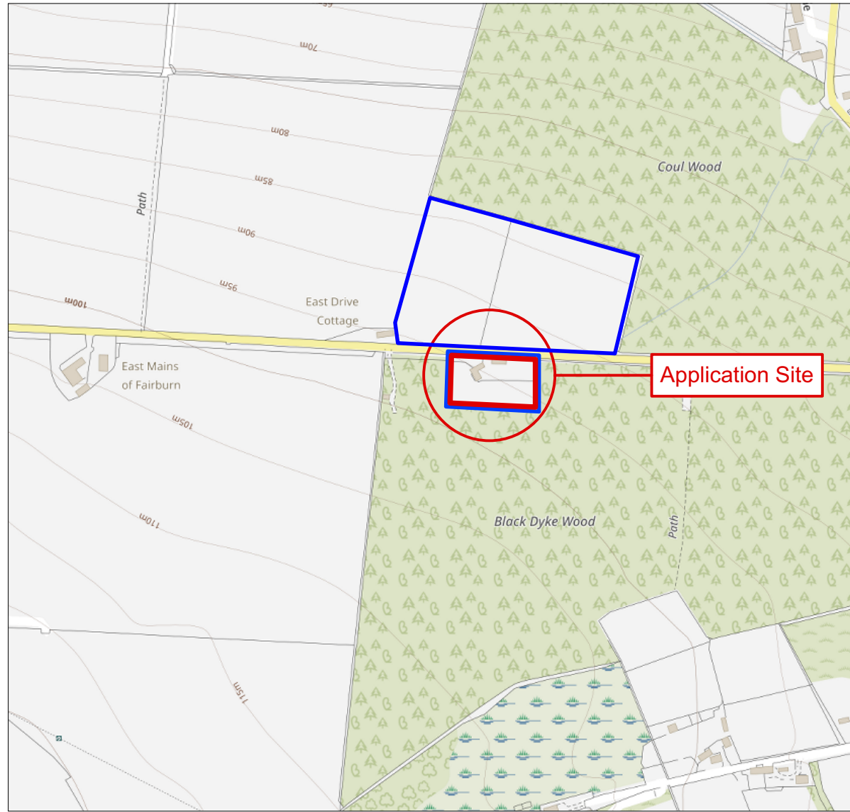
BLOCK PLAN Scale: 1:5000