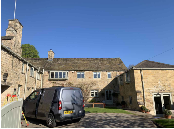
EXISTING SOUTH ELEVATION FROM COLLEGE FARM LANE

SOUTH ELEVATION AS EXISTING & AS PROPOSED SCALE 1:100 @ A3