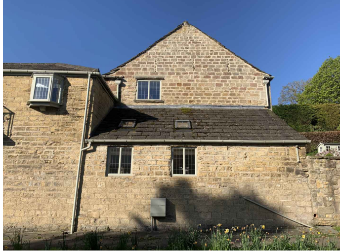
EXISTING EAST ELEVATION FROM NORTHGATE LANE