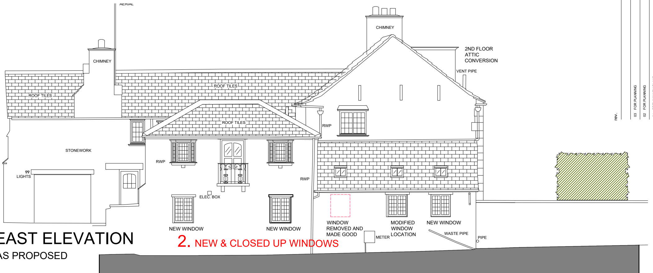
EAST ELEVATION AS PROPOSED