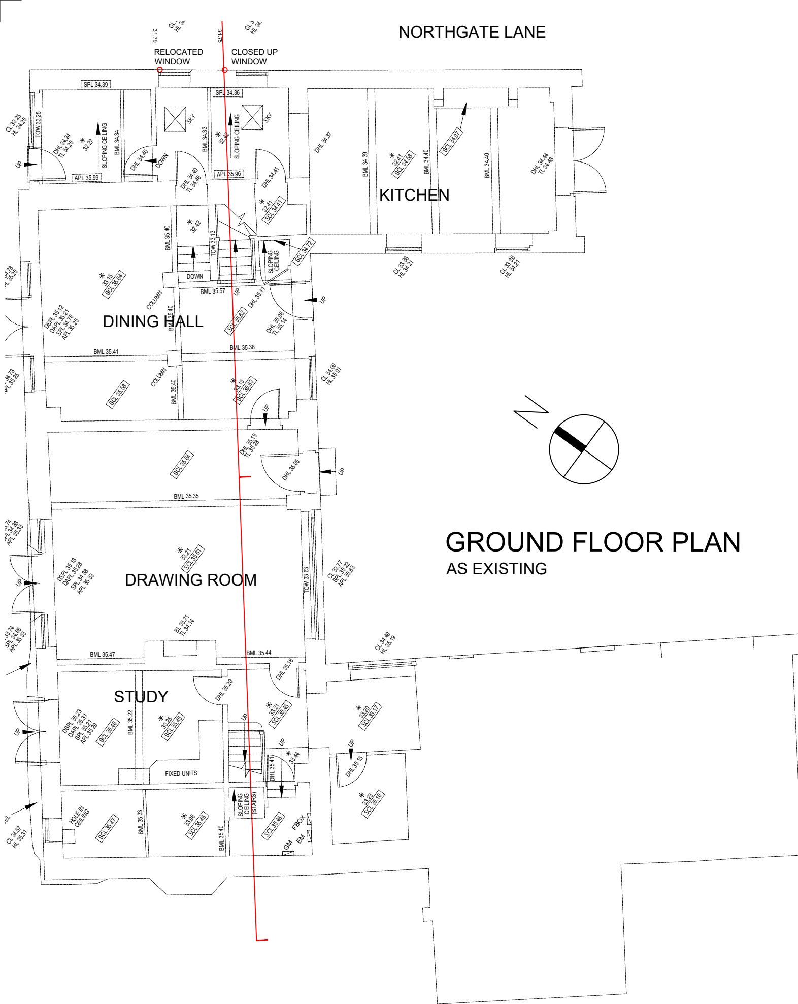
GROUND FLOOR PLAN AS EXISTING