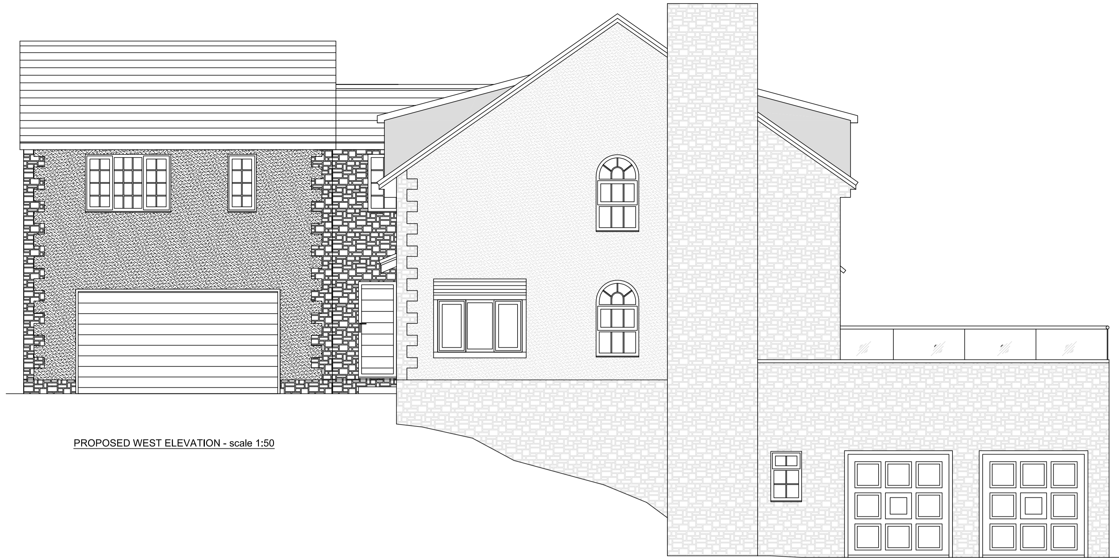
PROPOSED WEST ELEVATION - scale 1:50