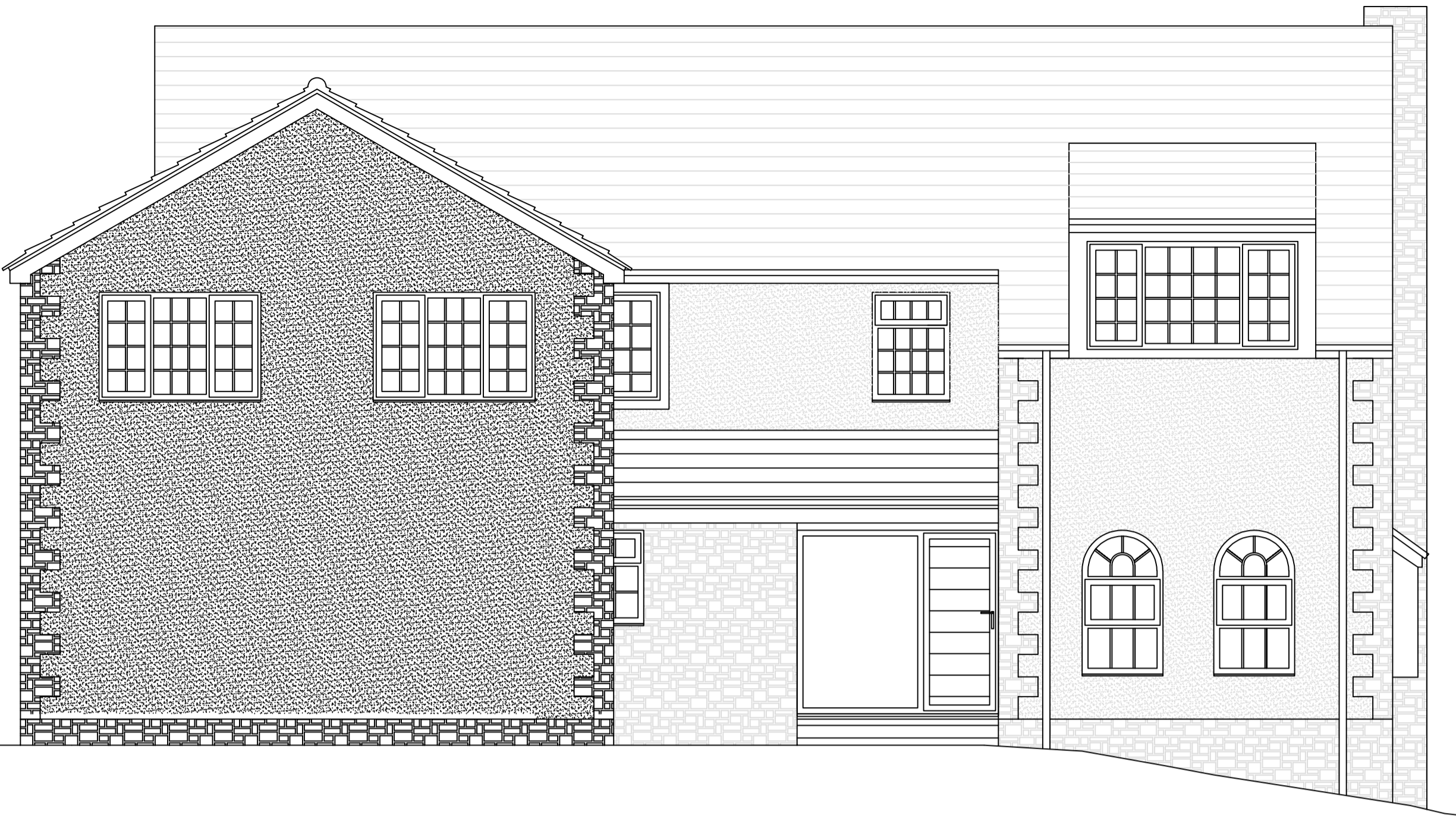
PROPOSED FRONT ELEVATION - scale 1:50