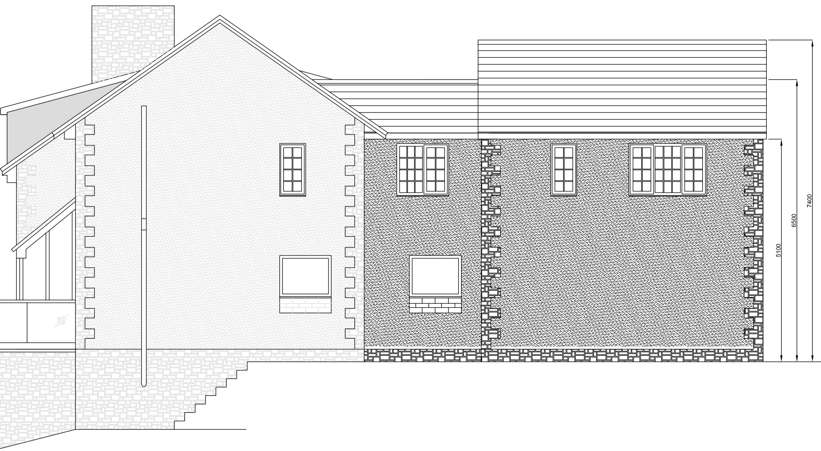
PROPOSED EAST ELEVATION - scale 1:50