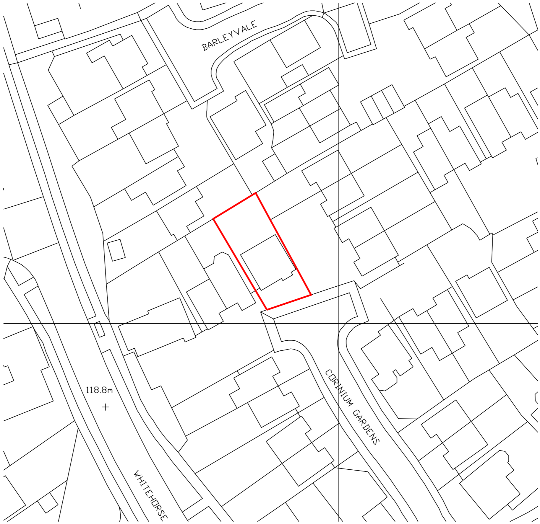
02 LOCATION PLAN 000 A1/A3 @ 1:250/ 1:500